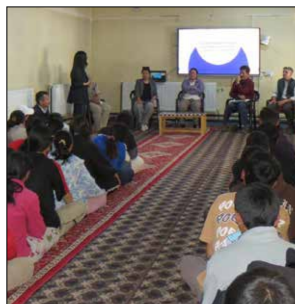
An awareness programme on drug abuse was organised at the Residential Hostel, Khatse, on June 1 with the objective of educating students about the harmful effects of substance abuse and promoting a healthy, responsible lifestyle.