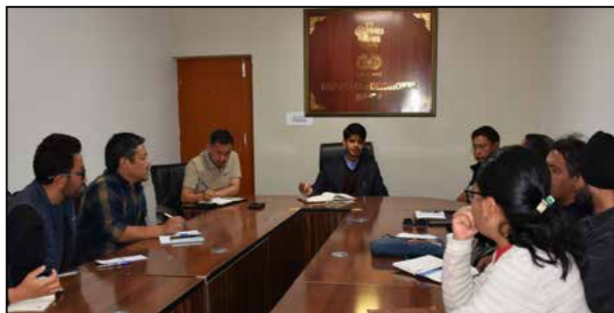
Photo Caption: Deputy Commissioner Nubra, Mukul Beniwal, chairing a meeting with officials of PDD and LREDA.