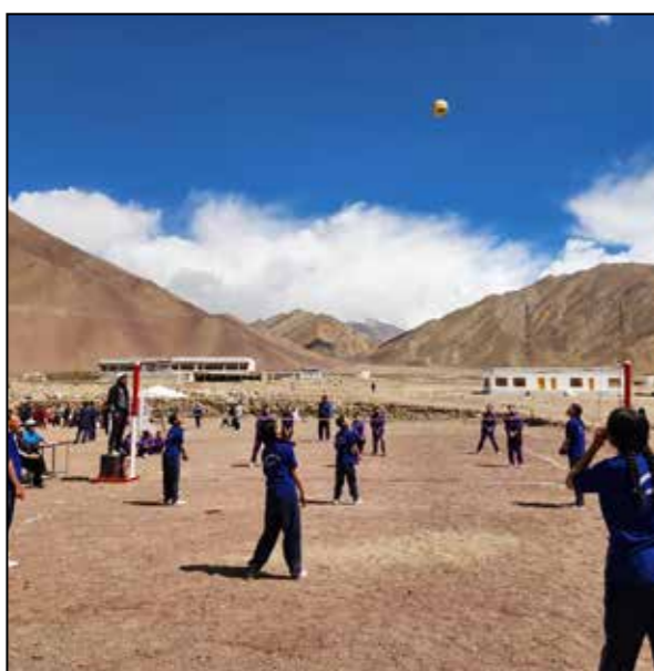
The Zonal Level Inter-School Tournament for Middle Schools of Nyoma and Durbuk Zones held at Government Higher Secondary School Nyoma. The tournament has brought together young student athletes from various schools across the two zones to participate in different sporting events, promoting sportsmanship, teamwork, and healthy competition.