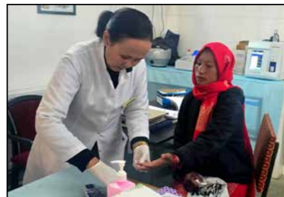
Photo Caption: During the special PMSMA session, woman attended receiving check-ups.

Nine pregnant women receive comprehensive antenatal care and counselling services