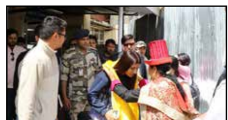
Photo caption: Union Minister of State for Youth Affairs and Sports, Raksha Khadse being welcomed in Leh.