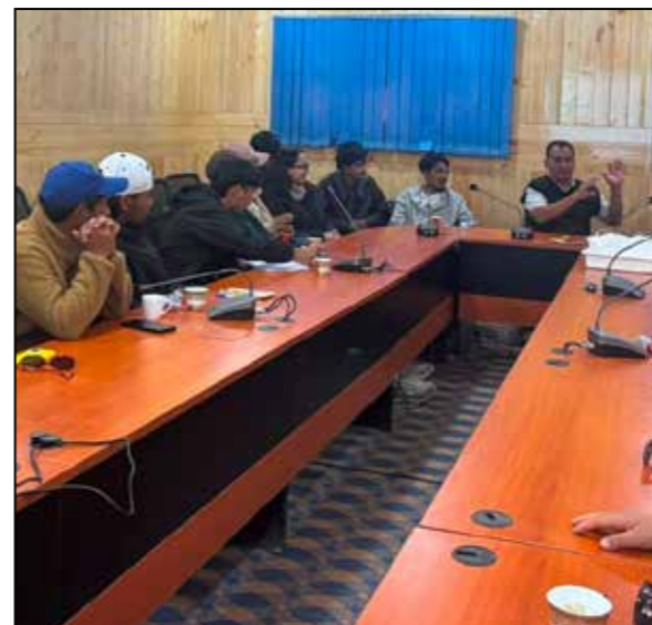
Government Degree College (GDC) Zanskar organised an Interactive and Career Counselling Programme on June 10 in collaboration with Sindhu Central University, Ladakh, with the aim of creating awareness among students about higher education opportunities, scholarships, admissions, internships, and career prospects offered by the university.