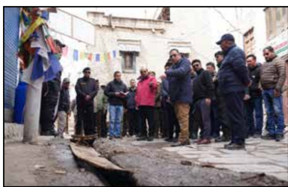
Photo Caption: LG Ladakh Vinai Kumar Saxena during his visit to Old town Leh.

Project to transform heritage precinct through an underground utility network, pedestrian-friendly infrastructure and enhanced urban aesthetics