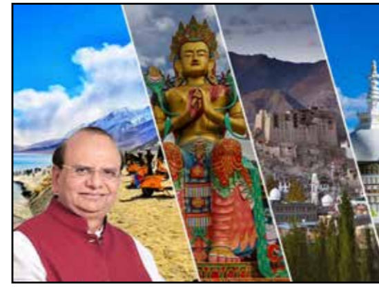
Reach Ladakh Correspondent

New autonomous body to unite government and tourism stakeholders for sustainable sectoral growth