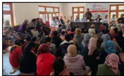
Photo Caption: Participants during the financial literacy awareness programme at Chemday, Kharu.