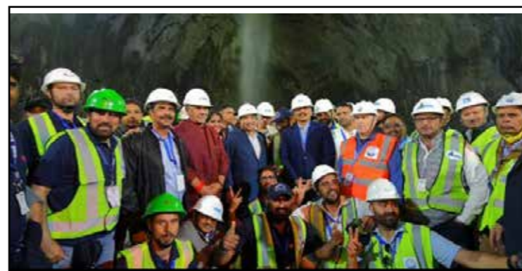
Photo caption: During the historic breakthrough of the main tunnel at the eastern portal of the Zojila Tunnel Project at Minamarg in Kargil district.

Union Minister outlines ₹18,000-crore infrastructure push for Ladakh