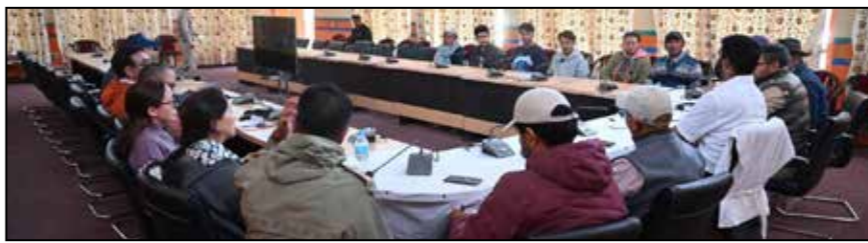
Photo Caption: During a meeting on drug abuse awareness and prevention at the Conference Hall, Dak Bungalow, Padum.