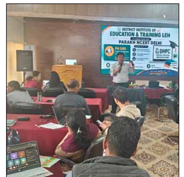
In accordance with the circular issued by the District Institute of Education and Training (DIET), Leh, mandating the participation of concerned Headmasters and School Administrators of PM SHRI Schools in the Digital Holistic Progress Card (DHPC) training programme, the first day of the two-day online hands-on training workshop was successfully conducted on June 1, 2026.