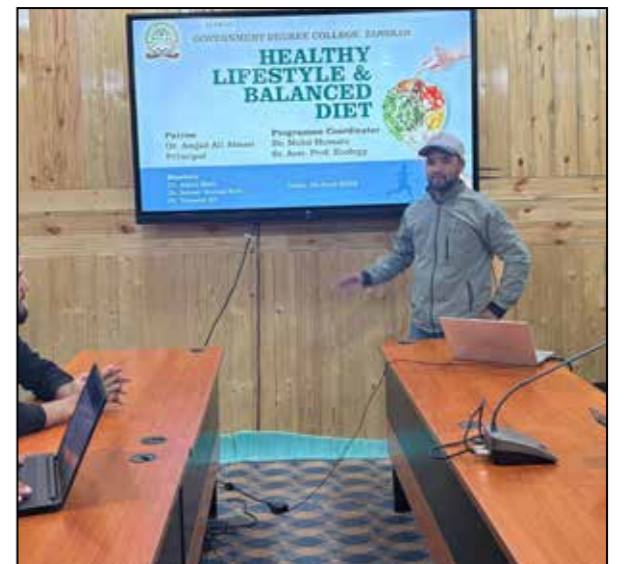
The Healthy Lifestyle and Balanced Diet Committee of Government Degree College (GDC) Zanskar organised an awareness programme on the importance of a healthy lifestyle and balanced dietary habits at the college conference hall on June 10.