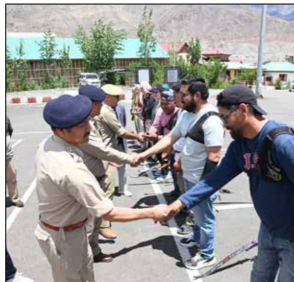
District Police Kargil commenced a series of sports events under the Civic Action Programme with the inauguration of an Archery Tournament at the District Police Lines (DPL), Kargil on June 6 in coordination with the Ladakh Archery Association, Kargil Wing.