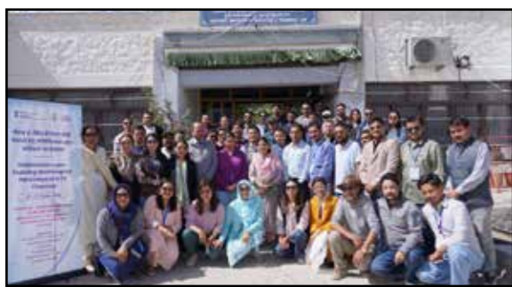
Photo Caption: During the concluding of the four-day PM eVidya DTH TV channels orientation-cum-training workshop.