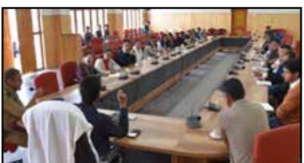
Photo Caption: Deputy Commissioner Nubra, Mukul Beniwal, IAS, chairing a review meeting on the prevention, control and awareness of drug abuse in Nubra district.

Directs stakeholders to intensify awareness campaigns as police strengthen vigilance against narcotics trafficking