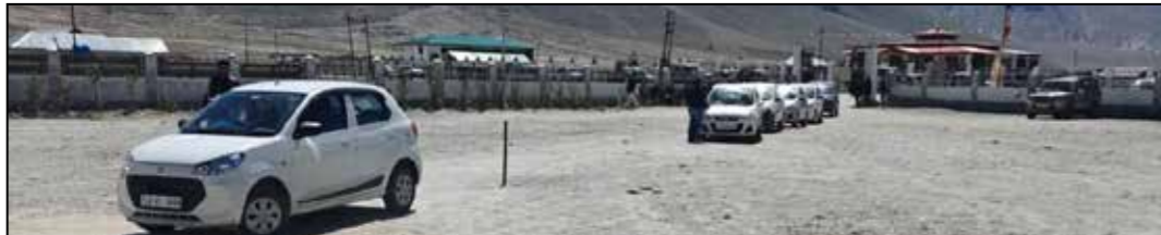
Photo Caption: During the two-day camp office organised by the Assistant Regional Transport Office (ARTO), Kargil in Zanskar.