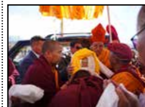
Reach Ladakh Correspondent

LEH: The sacred Holy Buddha Relics, after completing their revered visit to Zanskar, returned to Leh on May 13 and were ceremonially placed at the Dharma Centre for public veneration and prayers.