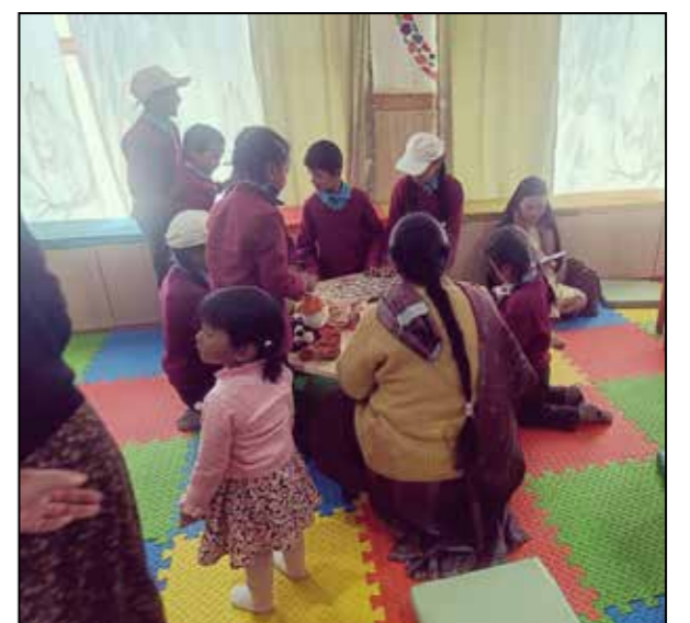
As part of an educational exposure and learning initiative, students and teachers from Ladakh Model Primary School, Changspa, visited the District Institute of Education and Training (DIET) Leh on May 9. During the visit, the students explored the Balvatika Model Room, Bhoti Lab and Mathematics Lab established at DIET Leh.