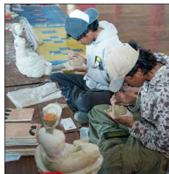
The three-day workshop on traditional Himalayan art and heritage practices, organised by the Central Institute of Buddhist Studies in connection with the Sacred Exposition of the Holy Relics of the Tathagata in Leh.