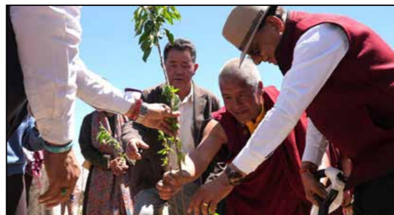
Photo Caption: Lieutenant Governor of UT Ladakh, Vinai Kumar Saxena inaugurating the plantation of 2,100 cherry saplings at the Drikung Dharma Foundation in Phyang.