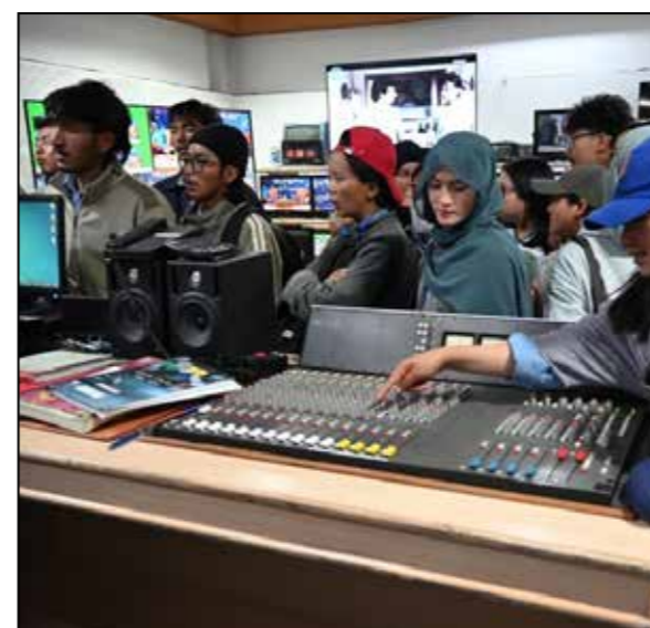
The Department of Mass Communication and Journalism, Eliezer Joldan Memorial (EJM) College Leh, organised an academic field visit to All India Radio (AIR) Leh and Doordarshan Leh on May 8. A group of 32 students participated in the visit, which aimed to provide practical exposure to the functioning of radio and television broadcasting.