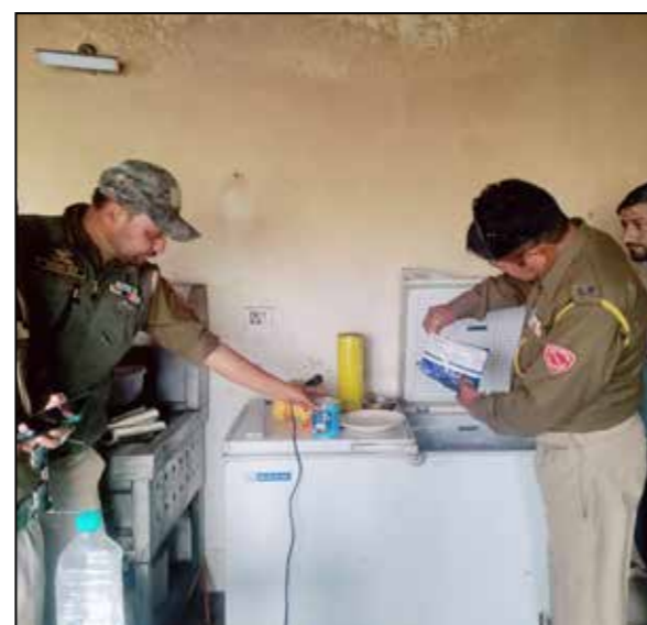
Following the order issued by the Sub-Divisional Magistrate, Nubra for monitoring and checking of essential commodities, a market inspection was conducted on May 7 in Tehsil Diskit by the constituted committee comprising officials from the Revenue, Police, Food Safety and Supply Departments.