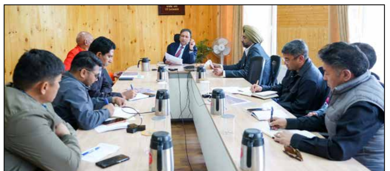
Photo Caption: Chief Secretary of the Union Territory of Ladakh, Ashish Kundra reviewing preparations for the upcoming International Day of Yoga 2026 celebrations in Ladakh.