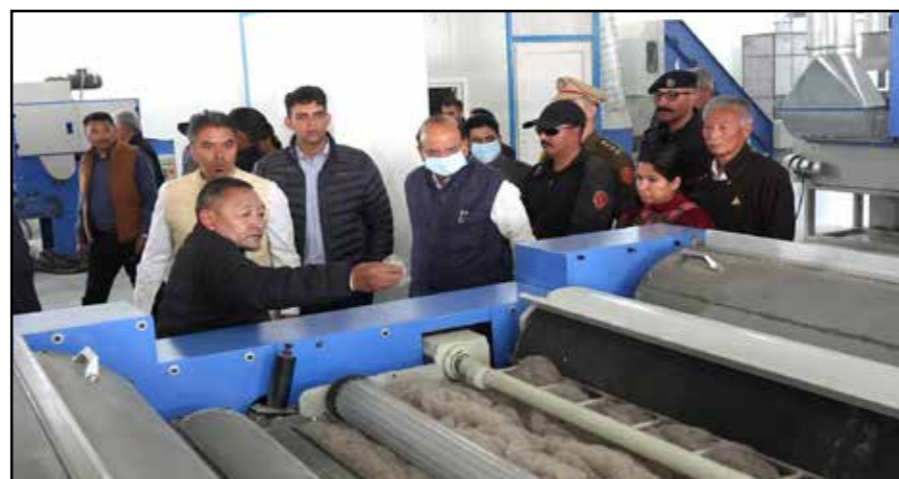
Reach Ladakh Correspondent

Reiterates vision to make Ladakh a global Pashmina hub