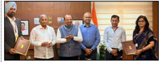
Reach Ladakh Correspondent

100% central funding for household water connections in Ladakh