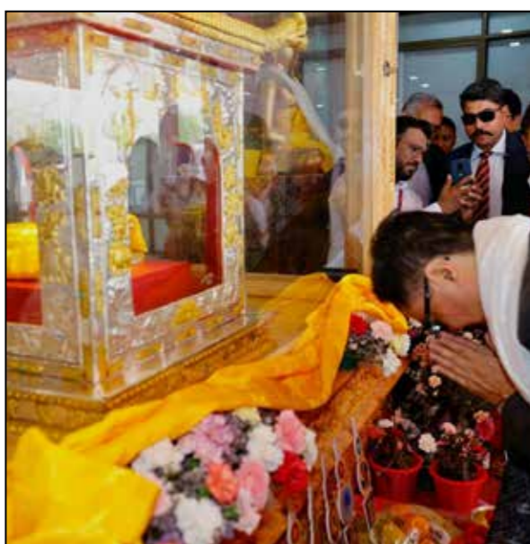
Union Minister Kiren Rijiju visited Jivetsal, Choglamsar on May 5 to witness the exposition of the Holy Relics of Gautama Buddha. During his visit, the Minister paid homage to the sacred relics and offered prayers, highlighting the spiritual and cultural significance of the exposition.