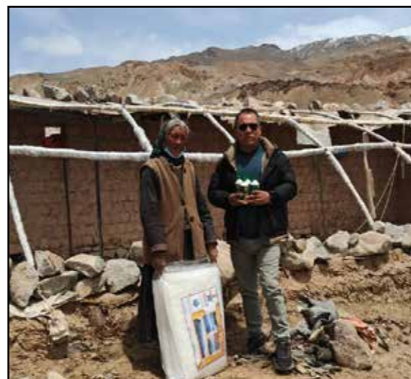
Photo Caption: KVK Nyoma distributing the greenhouse UV films to farmer of Tsaga village.