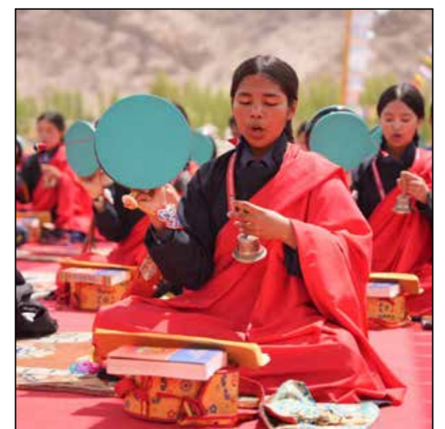
A Chöd prayer ceremony was presented by approximately 100 students of Druk Padma Karpo School, Shey, at Jive-Tsal on the fourth day of the Sacred Exposition of the Holy Relics of the Tathagata in the Union Territory of Ladakh.