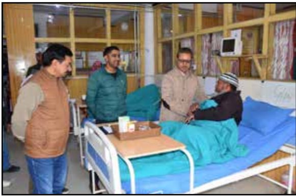
Photo Caption: Deputy Commissioner of Drass, Imteez Kacho assessing the status of healthcare services and facilities.