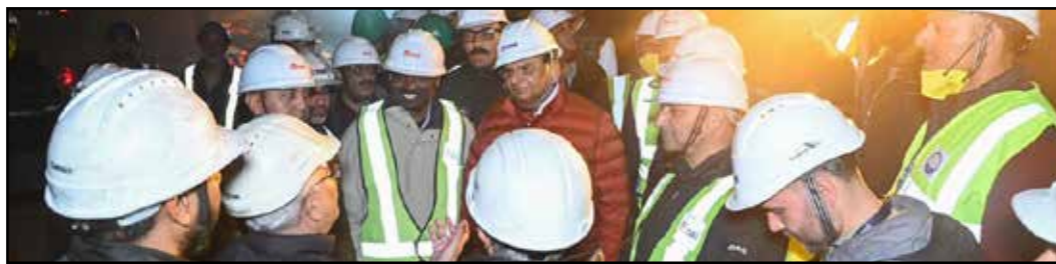
Photo Caption: Lieutenant Governor of the Union Territory of Ladakh, Vinai Kumar Saxena reviewing the progress of the ongoing construction work of the Zoji-La Tunnel.

Expresses satisfaction, calls for expediting work to ensure year-round connectivity to Ladakh