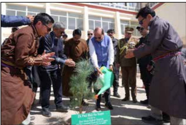
Photo Caption: Lieutenant Governor of Union Territory of Ladakh, Vinai Kumar Saxena planting a sapling under the “Ek Ped Maa Ke Naam” initiative at Ladakh university campus.