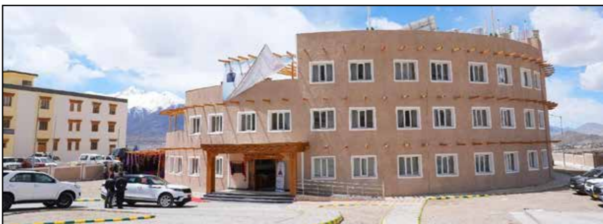
Photo Caption: Old Age Home (Zimskhang) for senior citizens at Saboonthang.

L-G emphasises inclusive development and strengthened elderly care services