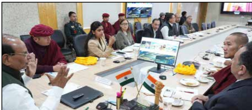
Photo Caption: L-G, Vinai Kumar Saxena, chairing a meeting with venerable Rinpoches, monks, government officials and concerned stakeholders on Sacred Exposition of the Holy Relics of Lord Buddha in Leh and Zanskar.

Calls for seamless arrangements, world-class experience for devotees