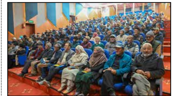
Photo Caption: During the Hajj Orientation and Training Programme for Hajj 2026 (Hijri 1447) at the Syed Mehdi Memorial Auditorium Hall in Kargil.

Orientation programme held in Kargil to guide pilgrims on rituals and procedures