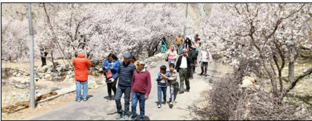
Photo Caption: Tourists walking in the blooming apricot orchards in Kargil.