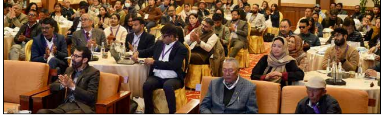
Photo Caption: Participants during the two-day Trans-Himalayan Urban Climate conclave in Leh.