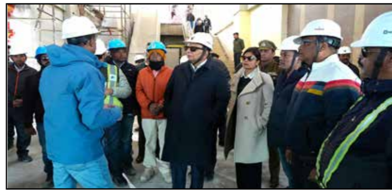
Photo Caption: Lieutenant Governor of the Union Territory of Ladakh, Vinai Kumar Saxena reviewing the progress of the New Terminal Building of Kushok Bakula Rinpoche Airport.

New terminal to boost tourist footfall; officials asked to meet July 2026 deadline