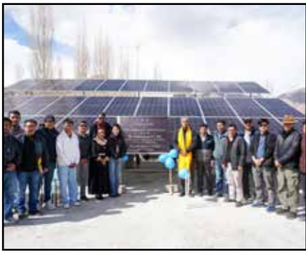
Photo Caption: During the inauguration of the first commercial rooftop solar installation at Hotel Barath, Leh.