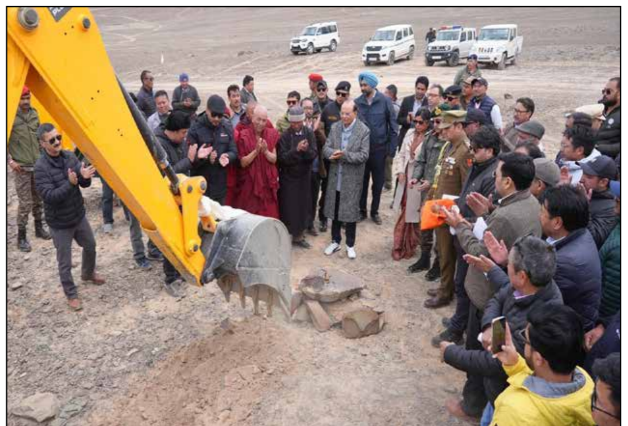
Photo Caption: Lieutenant Governor of the Union Territory of Ladakh, Vinai Kumar Saxena launching the Project Him Sarovar.

Calls for collective efforts to create new "green and blue assets" for ecological balance