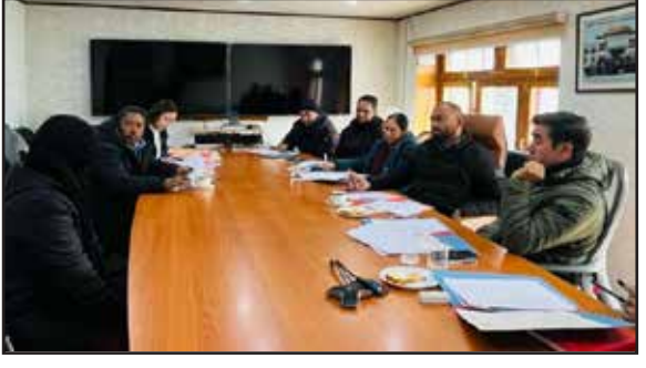
The Sindhu Infrastructure Development Corporation (SIDCO), Leh, convening its first Project Implementation Committee meeting.