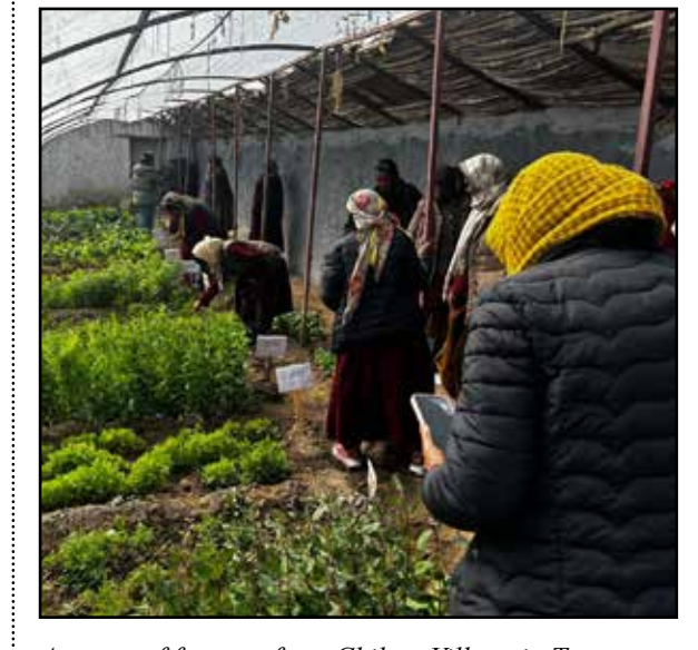
A group of farmers from Chilam Village in Tangtse Tehsil during an exposure tour to the School of Agricultural Sciences and Technology (SAS&T), Leh