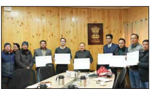
Chief Secretary officially launching the annual activity calendar for the celebration of International Year of Cooperatives across Ladakh.