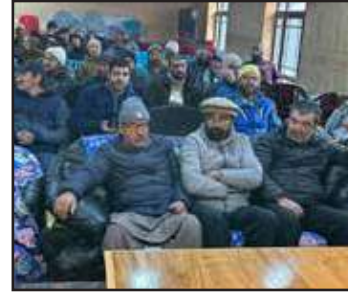
Participants during the two-day district-level multilingual Hamdiya Naatiya Mushaira.