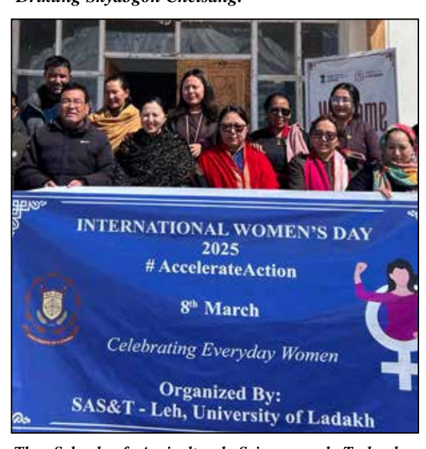
The School of Agricultural Science and Technology (SAS&T), University of Ladakh, Leh, marked International Women's Day with the theme "Accelerate Action." The event featured inspiring speeches and discussions aimed at empowering women in education, professional spaces, and society.