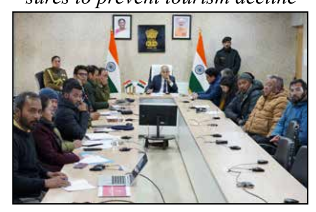
Lieutenant Governor of Ladakh convening a meeting with tourism stakeholders, Chairmen of LAHDC Leh and Kargil, and UT Administration officials to discuss strategies for boosting tourism in Ladakh.

Ladakh to adopt proactive measures to prevent tourism decline