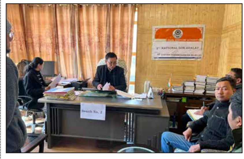
Reach Ladakh Correspondent

LEH: The first National Lok Adalat of 2025 was successfully conducted across the Union Territory of Ladakh on March 8, with 11 benches taking up 724 cases. A total of 532 cases were amicably settled, resulting in a settlement amount of ₹1,53,52,431 paid as compensation in cases related to motor accident claims, civil disputes, criminal matters, labour disputes, electricity and land acquisition cases, family matters, cheque dishonor cases, and bank recoveries.