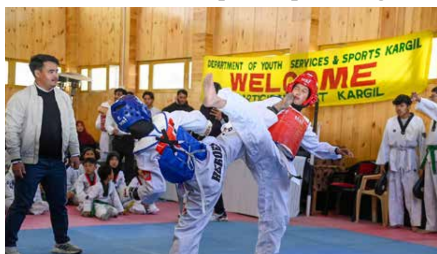
Athletes during the 3rd UT Ladakh Taekwondo Championship in Kargil.