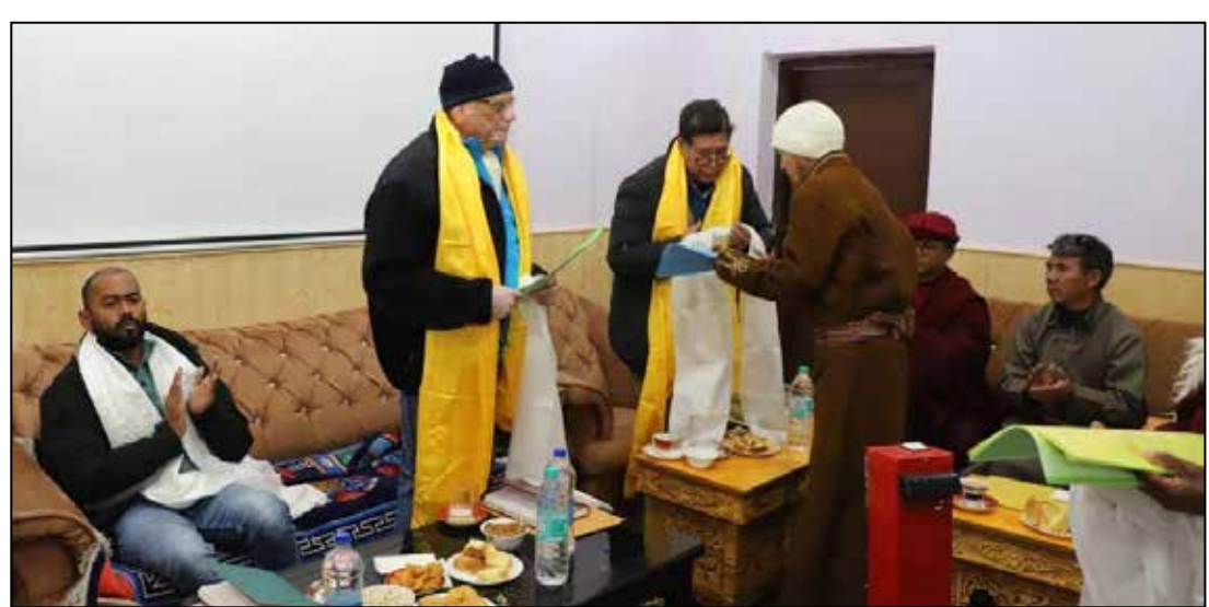
The New District Committee during their visit to Nyoma block.