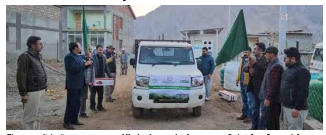
Flagging off the first consignment of Karkitchoo apples for export to Dubai from Rangyul Organic Producer Company Ltd cold storage unit in Kargil.