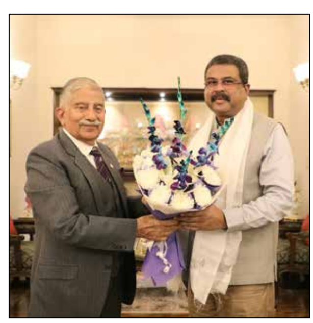
Lieutenant Governor of Ladakh, Brigadier (Dr) BD Mishra (Retd) met Union Minister of Education Minister, Dharmendra Pradhan, and discussed several education-related issues concerning the students and staff of schools and colleges of Ladakh.