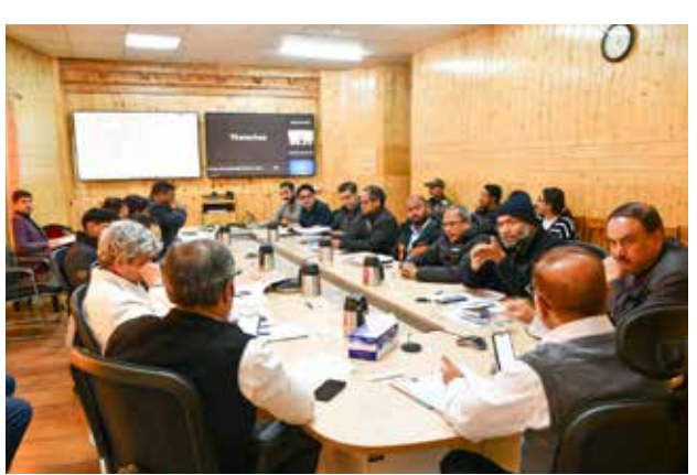
Reach Ladakh Correspondent

chaired a meeting to review the action taken by concerned departments regarding the tragic school bus accident at Durbuk, Leh, on August 22, 2023, which resulted in seven deaths and 21 injuries. The meeting, held at the Civil Secretariat