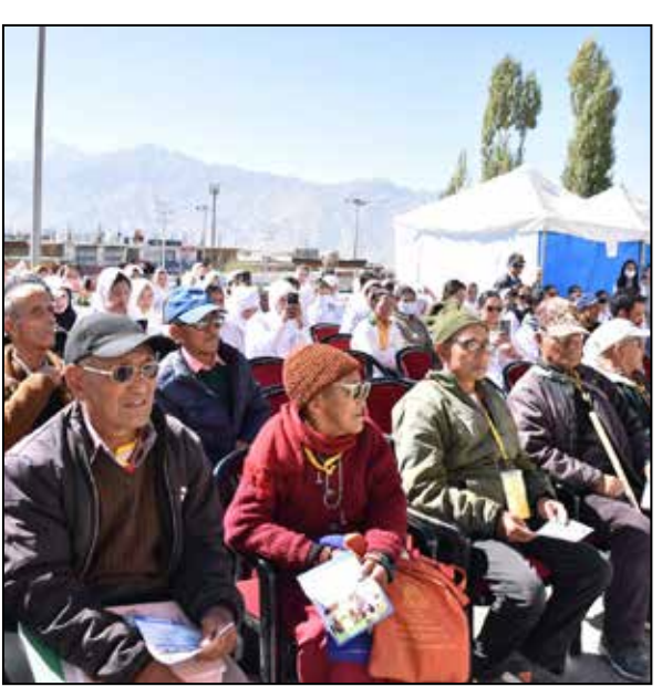
The Health and Family Welfare Department, Leh, under the National Programme for Health Care of the Elderly (NPHCE), celebrated the International Day of Older Persons at Sonam Norboo Memorial (SNM) Hospital. The event focused on the theme "Ageing with Dignity" and included a multispeciality health camp providing senior citizens with essential medical care.