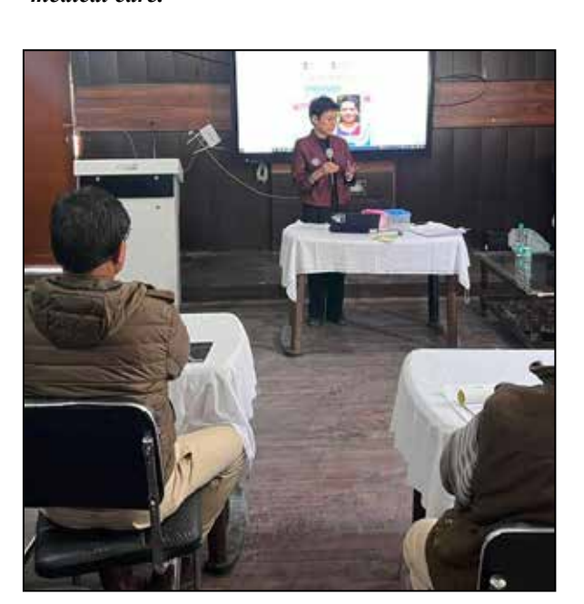
Directorate of Mission Shakti (Social and Tribal Welfare) in collaboration with National Institute of Social Defence (NISD), Ministry of Social Justice and Empowerment, GoI today conducted Training of Trainer's program on Transgender Identities and Inclusion at DIET Kargil.