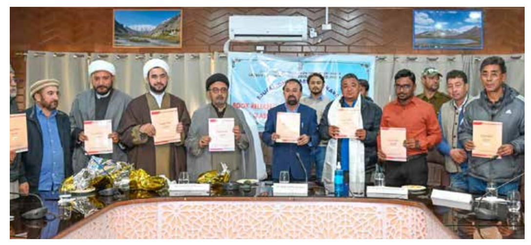
During the release of the first-ever Arabic textbook for government schools.