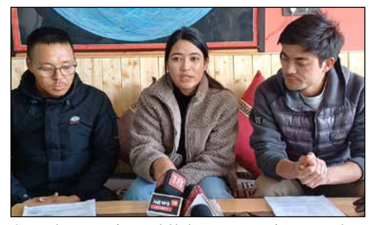
Gazetted aspirants from Ladakh during press conference in Leh.