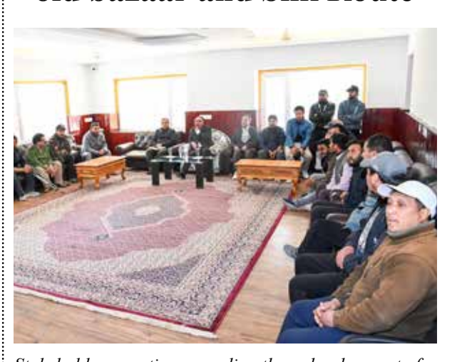
Stakeholders meeting regarding the redevelopment of the Old Bazaar and Silk Route in Kargil.