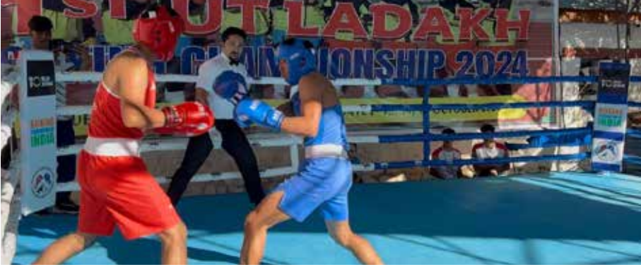
Reach Ladakh Correspondent

ing Centre in Kargil on October 15, with around 100 athletes from both Kargil and Leh districts participating in the threeday event.