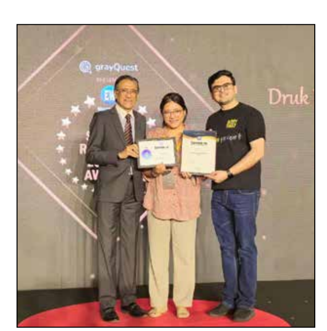
Druk Padma Karpo School ranked India's top schools in the Education World India School Rankings (EWISR) 2024-25.