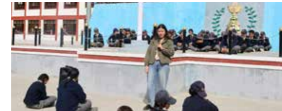
Department of Health, Ladakh, introducing comprehensive health initiative in schools.