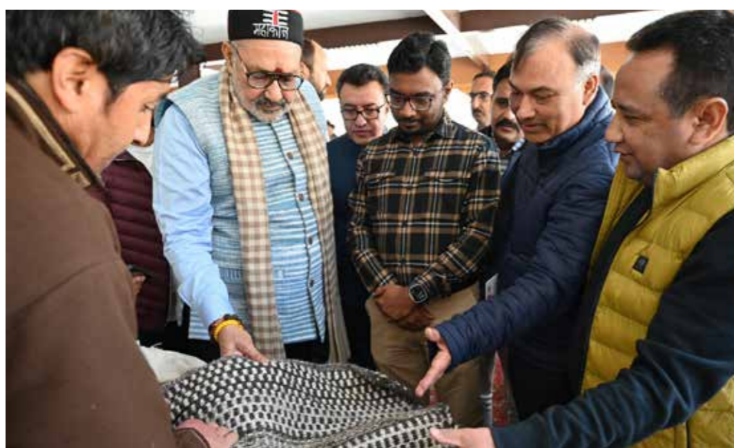
Union Minister for Textiles, Giriraj Singh interacting with Kargil's local entrepreneurs and SHGs.