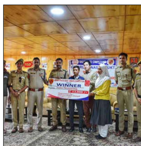
District Police Kargil organised a district-level quiz and debate competition as part of the Civil Action Program. Students from various blocks and tehsils across Kargil participated in the event.