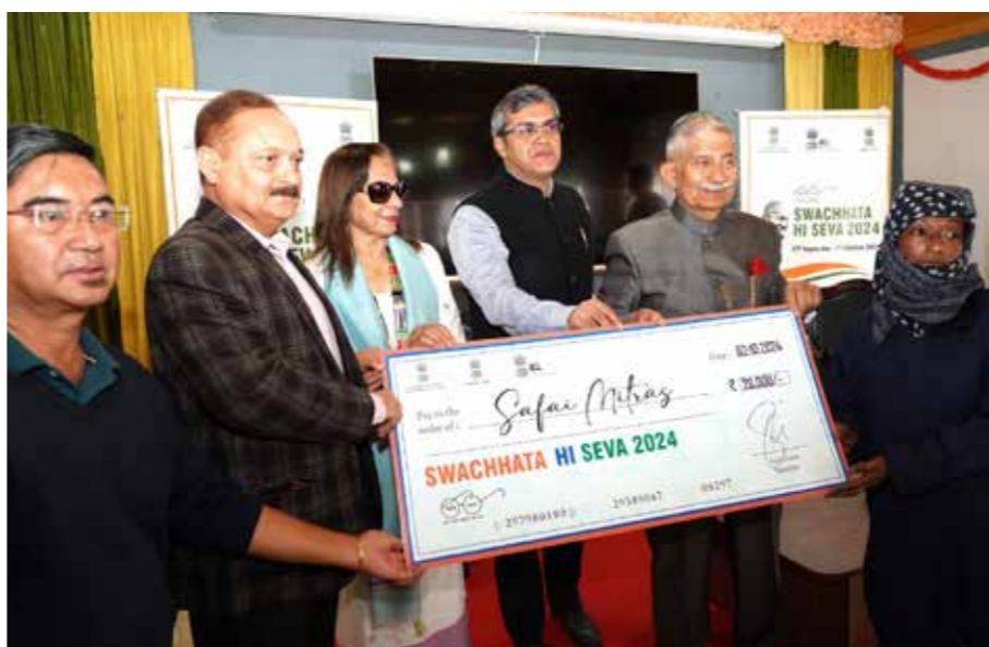
L-G along with other officials felicitating Safai Mitras for their services.

Inaugurates WASH facility and honors safai mitras