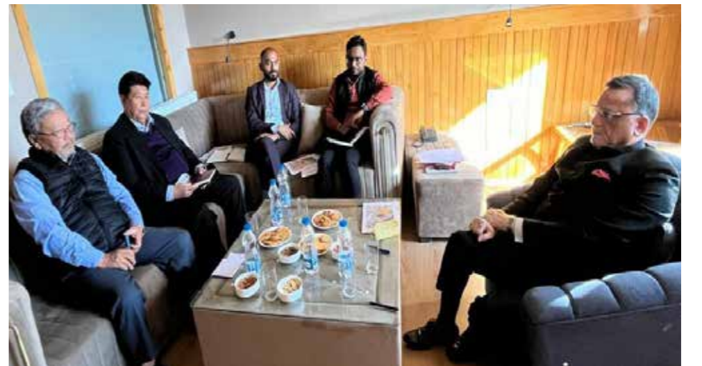
The newly constituted committee assessing various aspects related to the formation of five new districts in Union Territory of Ladakh.