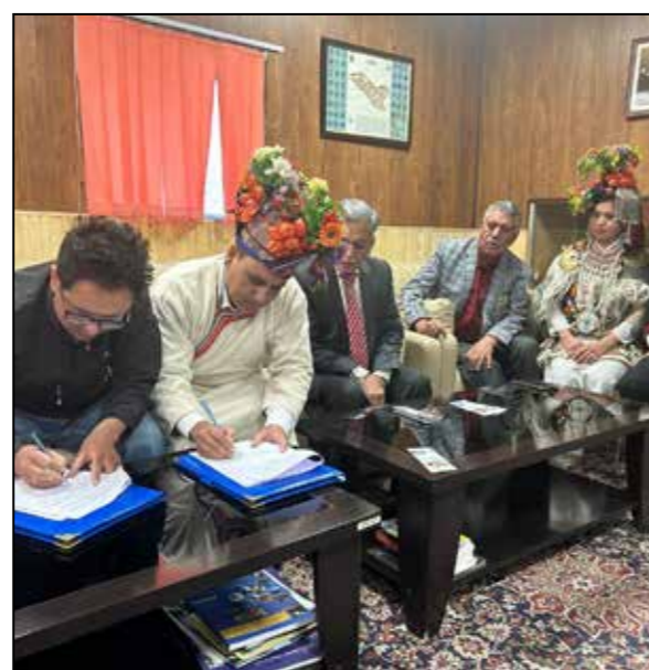
A Memorandum of Understanding was signed between University of Ladakh and Himalayan Museum of Ladakh Culture and Heritage Garkon under Preservation of Aryan Culture and Educational Society UT Ladakh.