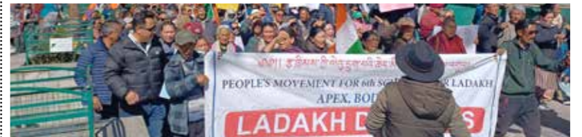
Peace protest rally at Leh market on October 13.