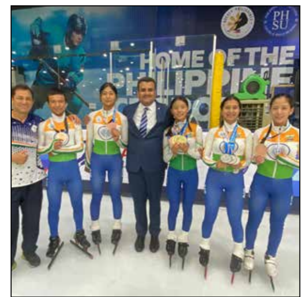
Team India has made a remarkable mark in the world of ice short track speed skating by securing an impressive 33 medals, including 10 from the Union Territory of Ladakh, at the SEA TROPHY competition.