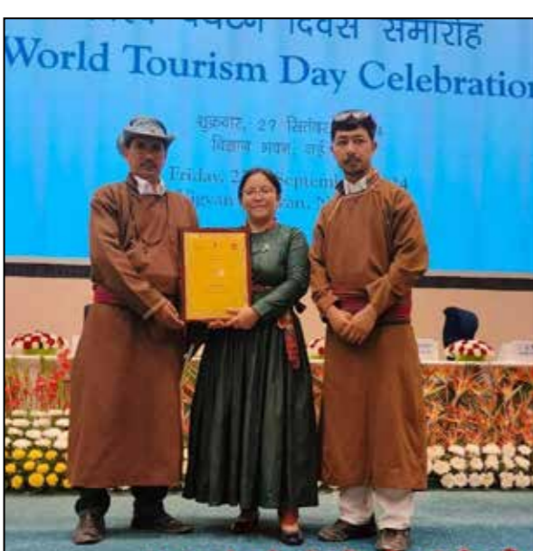
Tar Village recognized as one of the Best Tourism Villages of India 2024 in the Responsible Tourism Category. The award ceremony took place at Vigyan Bhawan, New Delhi.