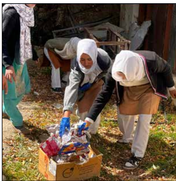
The Department of EVS and English, Sankoo Campus, Government Degree College, Kargil organized a cleanliness drive to educate students about the importance of a clean environment.