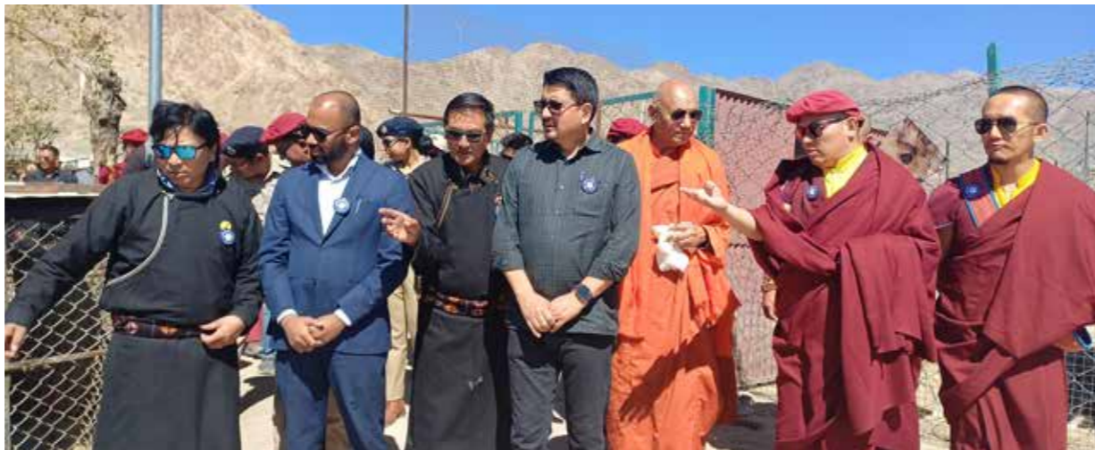
Dignitaries during their visit to Live to Rescue centre at Nang during 10 year celebration of the centre.