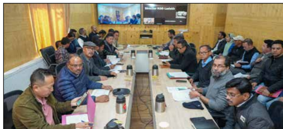
Meeting on reviewing the progress of developmental projects being executed by the Central Public Works Department (CPWD) for various departments.