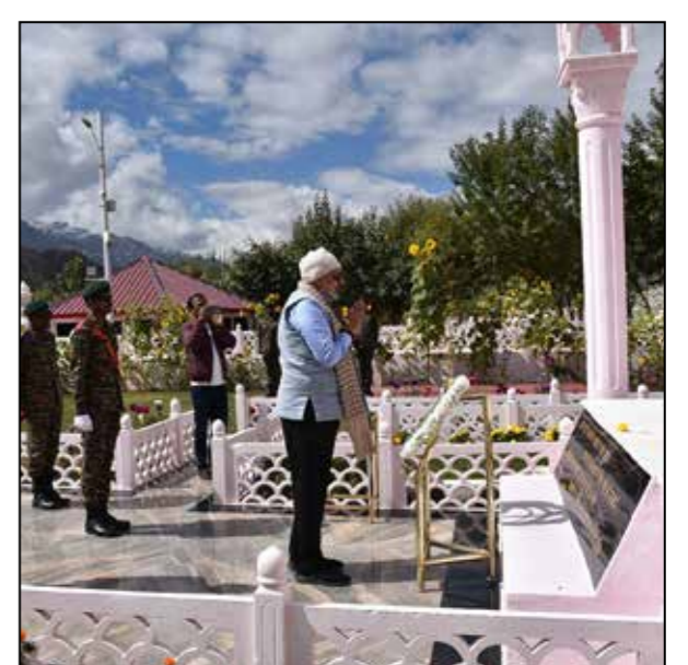
Union Minister for Textiles, Giriraj Singh paying tribute to martyrs of the 1999 Kargil War at Drass War Memorial.