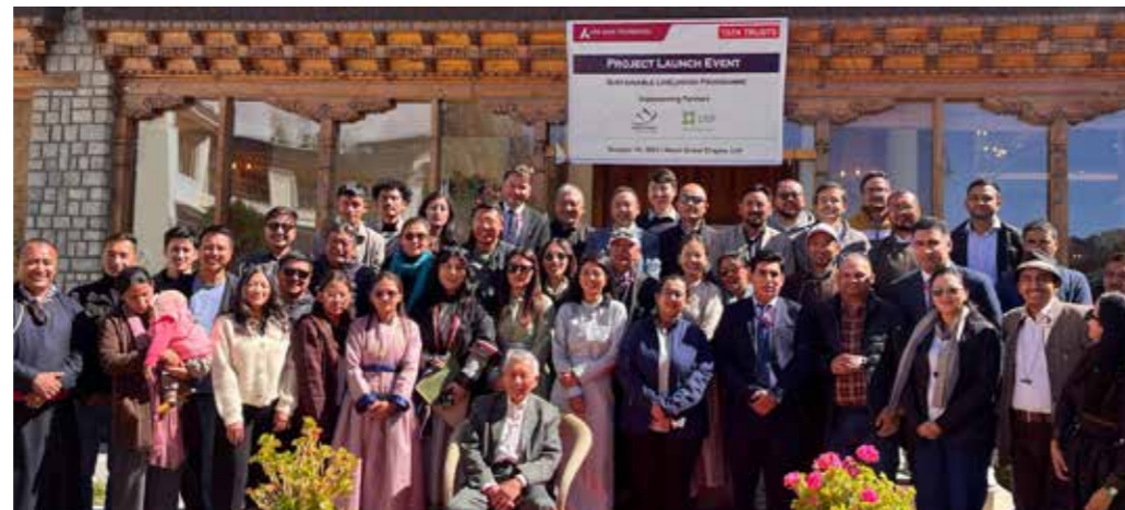
During the launch of the Sustainable Livelihood Programme.

Initiate by Axis Bank Foundation, Himmothan Society, and Leh Nutrition Project