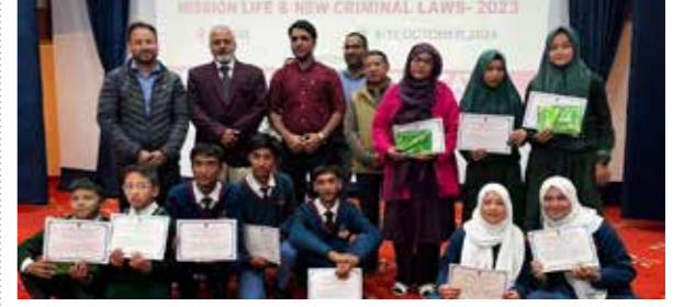
During the Integrated Communication and Outreach Programme at Syed Mehdi Memorial Hall, Kargil.