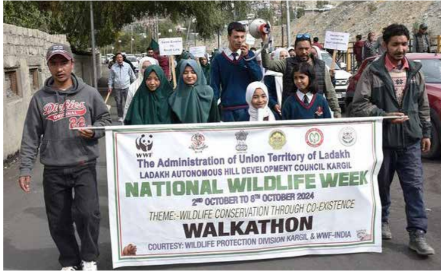
Reach Ladakh Correspondent

KARGIL: The Wildlife Protection Division Kargil, in collaboration with WWF India, organized a rally on wildlife conservation on October 9. Students of Mutahhary Public School, Suru Valley School, and Jaffaria Academy of Modern Education participated.