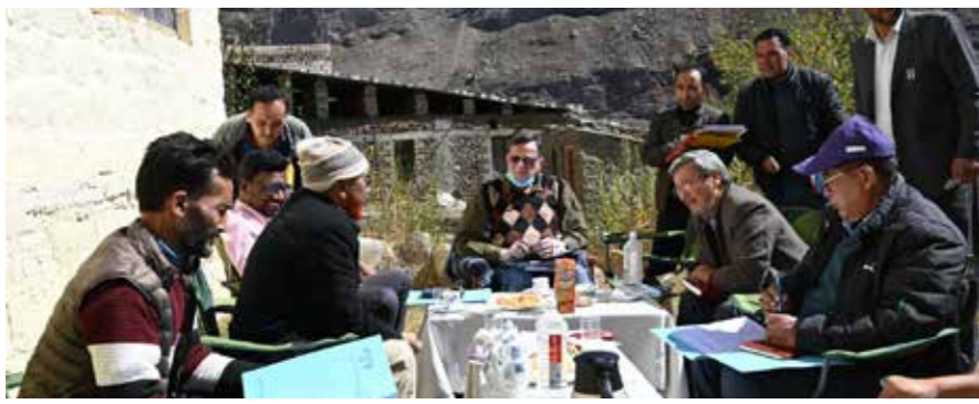
The new districts committee consulting with delegations from the Zaskar Subdivision.