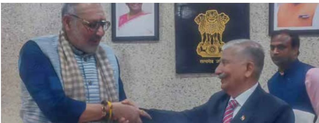
Union Minister of Textiles, Giriraj Singh, presenting Geographical Indication (GI) Registration Certificate for Ladakh’s Pashmina Wool to the Lieutenant Governor of Ladakh.