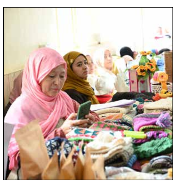
Tribal Cooperative Marketing Development Federation of India Ltd (TRIFED), under the Ministry of Tribal Affairs, Government of India, in collaboration with District Administration organized a Tribal Artisan Empanelment Mela (TAeM) at Handloom Department, Kargil.