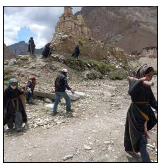
Rural Development Department Khaltse, conducted sanitation drive around the river, steam and ponds of Panchayat Halqa Kanji at Khaltse block, under the banner of "Swachhata Hi Seva" Campaign.