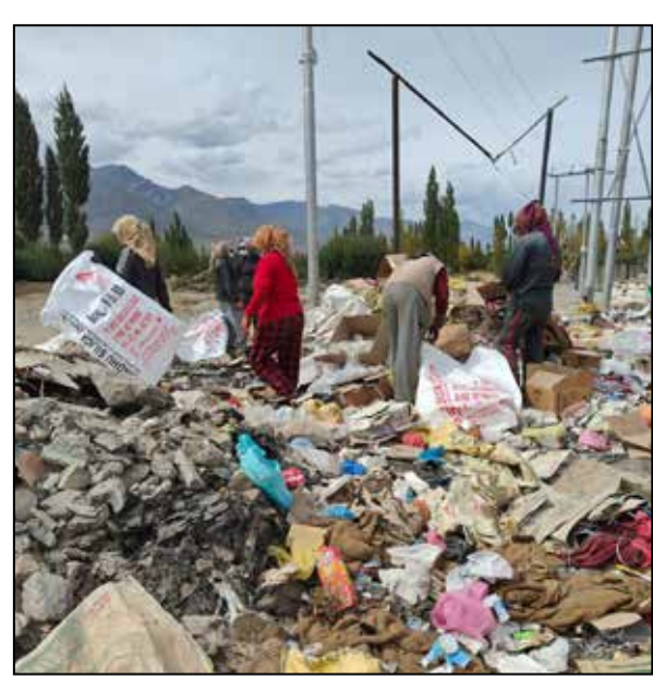
A day long cleanliness drive was conducted at Agling Spituk under the banner of "Swatchhta hi Seva" campaign. Officials of BDO Leh took part in the pro-