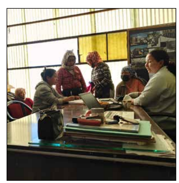
Medical Health checkup for workers of Tsangda project was conducted under the 'Swatchhta hi Seva' campaign at SRMC Choglamsar Leh by Block Development Office/RDD Leh.