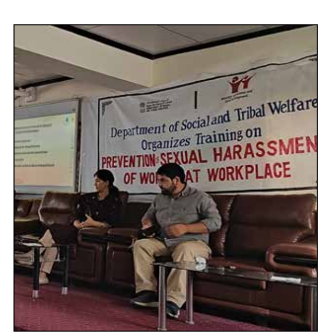
The Department of Social and Tribal Welfare organised a training session on preventing sexual harassment of women in the workplace for the faculty and students of Government Degree College Kargil.