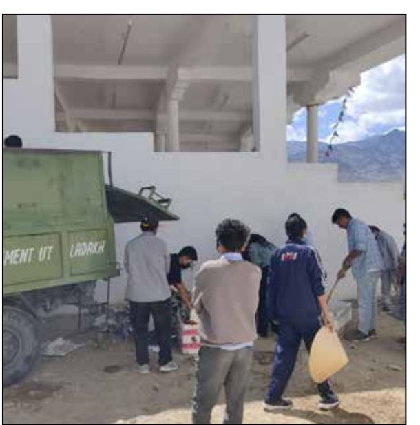
The NSS volunteers of EJM College Leh, started the Swachhta Abhiyan 2024 by cleaning the area around Sindhu Ghat. 35 students and 3 NSS staff members participated in the cleanliness drive.