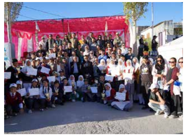
Participants of the UT-Level Science Exhibition.