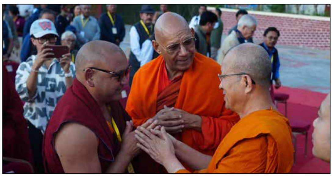
Reach Ladakh Correspondent

CHOGLAMSAR: In celebration of the 73rd birth anniversary of His Majesty King Maha Vajiralongkorn Bodindradebayavarangkun, the 10th King of the Chakri Dynasty of Thailand, 73 small Buddha statues were distributed at the Mahabodhi Sambodhi Retreat Centre on September 23.