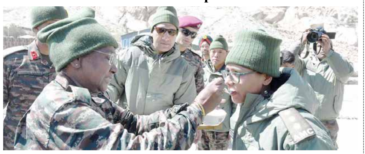
Photo Caption: President of India, Droupadi Murmu, with soldiers at Siachen Base Camp.