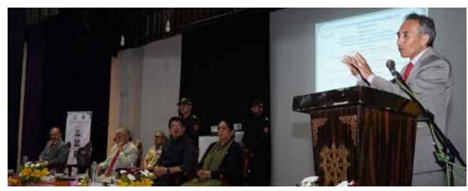
Chief Justice Tashi Rabstan of the High Court of J&K and Ladakh addressing the gathering during the one-day awareness programme on mediation for public representatives.