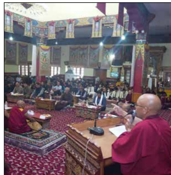
The Ladakh Buddhist Association (LBA) and Central Institute of Buddhist Studies (CIBS) jointly organized a daylong seminar on the Preservation and the Promotion of the Bhoti language at Chowkhang Vihara, Leh.