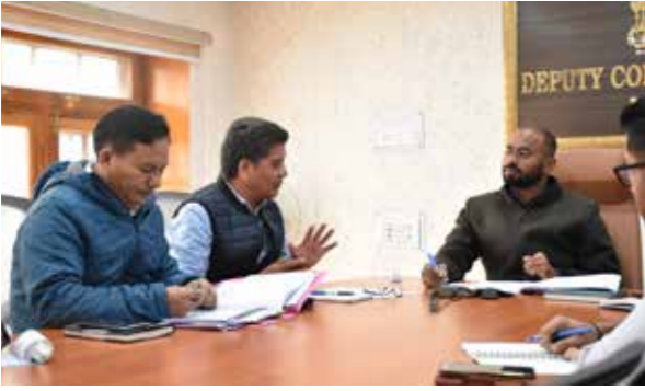
District Level Committee meeting for the implementation of the PM Surya Ghar Muft Bijli Yojana.