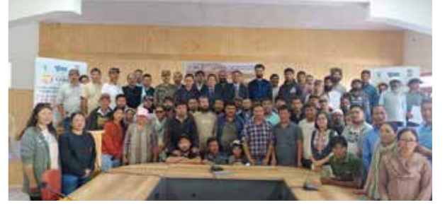
During the felicitation ceremony for double-humped camel farmers in Diskit.