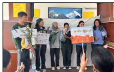
Student-led puppetry show at EJM college.

LEH: In collaboration with Charkha Communication Network, Delhi, the Department of Mass Communication & Journalism at Eliezer Joldan Memorial College, Leh, successfully concluded a 4-day puppetry-making and stop-motion animation workshop on September 6.