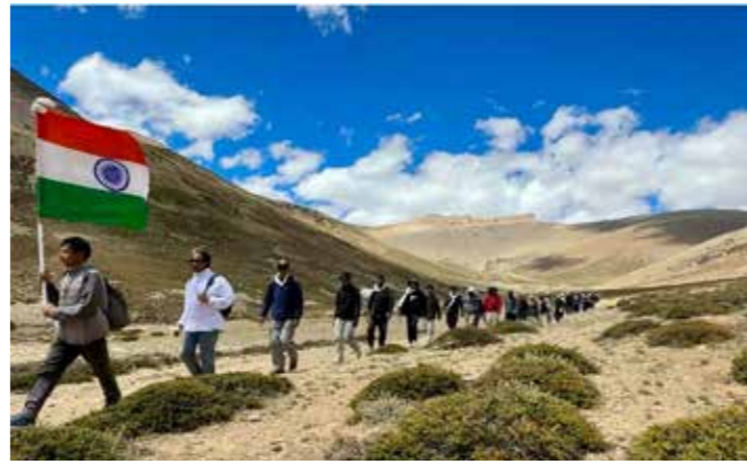
Volunteers of Delhi Chalo Padyatra.

LEH: Amidst the ongoing delay by the Ministry of Home Affairs (MHA) in resuming talks with the Apex Body and the Kargil Democratic Alliance (KDA) on Ladakh's 4-point agenda—Statehood, Sixth Schedule status, a dedicated Public Services Commission (PSC), and two Parliamentary seats for Ladakh—around 80 people in support of Apex body Leh are on foot march to national capital. The march, 'Delhi Chalo Padyatra' organised by Apex Body Leh is headed by Ramon Magsaysay awardee Sonam Wangchuk.