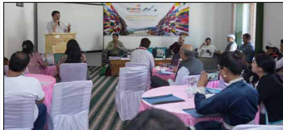
During the consultative discussion on State Policy on Older Persons of Ladakh.