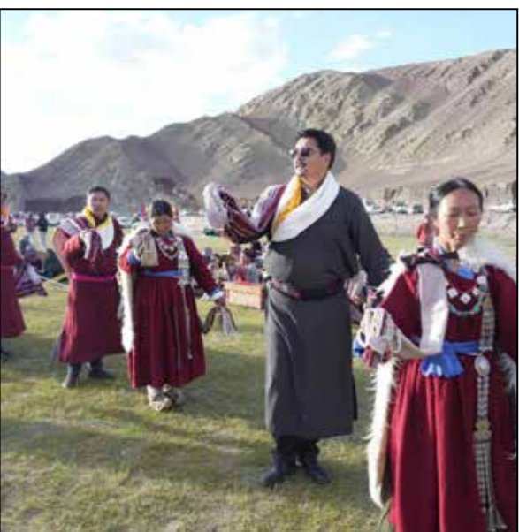
A grand celebration was held in Tangtse Community Hall and Watse Naga Cricket Ground, Nyoma, to mark the creation of the new Changthang District on Sept 5.