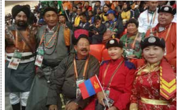
Archers from Ladakh at 5th World Nomad Games.