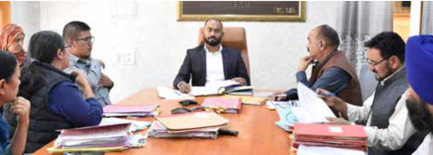
Deputy Commissioner Leh, Santosh Sukhadeve, reviewing departmental promotions and compassionate appointments.