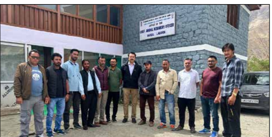
Para-veterinarians and trained attendants from the Animal Husbandry Department, Kargil.