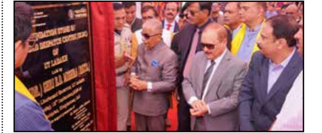
Reach Ladakh Correspondent

LEH: Lieutenant Governor of Ladakh, Brigadier (Dr) BD Mishra (Retd), laid the foundation stone for the State Load Dispatch Centre (SLDC)-cum-Renewable Energy Monitoring Centre (REMC) at the Power Development Department (PDD) Complex in Choglamsar on September 9. This significant project, approved by the Ministry of Power under the Power System Development Fund (PSDF), is valued at Rs 153.96 crore and will be implemented by POWERGRID.