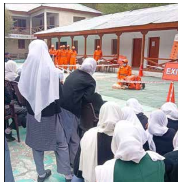
The 13th Battalion of the National Disaster Response Force (NDRF), Ludhiana, Punjab, in collaboration with the District Disaster Management Authority (DDMA) Kargil, conducted a comprehensive mock exercise on earthquake and cloudburst scenarios at Higher Secondary School, Chiktan.