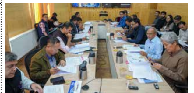
32nd Empowered Committee meeting for framing and review of Recruitment Rules for various Gazetted and Non-Gazetted posts within the UT Administration.

The District Award Investiture Ceremony was a fitting celebration of dedication and excellence, reaffirming the community's commitment to fostering and honoring exceptional talent and achievements.