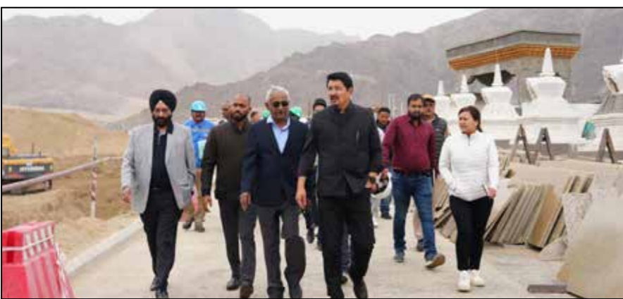
Chairman/CEC Adv. Tashi Gyalson during an official visit to the construction site of the new Domestic Terminal Building at Kushok Bakula Rinpoche (KBR) Airport in Leh.