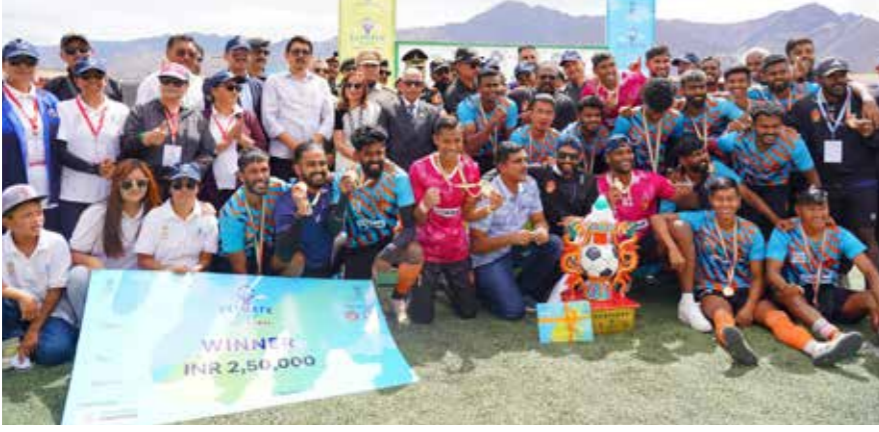
Reach Ladakh Correspondent