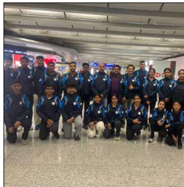
Head coach of Team India is leading a distinguished contingent of 22 elite skaters from 11 states, including three talented girls from Ladakh, to the prestigious Asia Cup competition in Jakarta. This follows an intensive 12 day training camp in Seoul, Korea, where the team sharpened their skills and prepared rigorously for the upcoming event