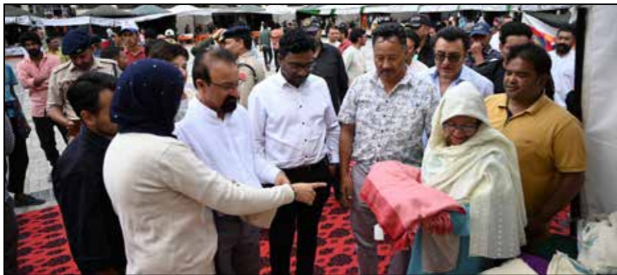
CEC and DC along with other district officers, inspecting stalls of the artisan showcasing a wide array of handloom and handicraft products.