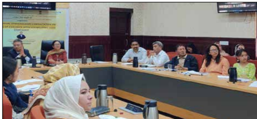
UT Ladakh stakeholders virtually participating in the one-day annual Consultation of Stakeholders in the UTs of J&K and Ladakh themed, "Protection of Children with Disabilities."