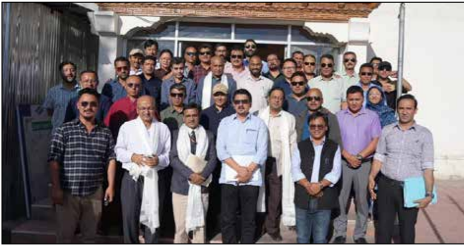
Officials of 5th Finance Commission and Hill Council Leh after the meeting.