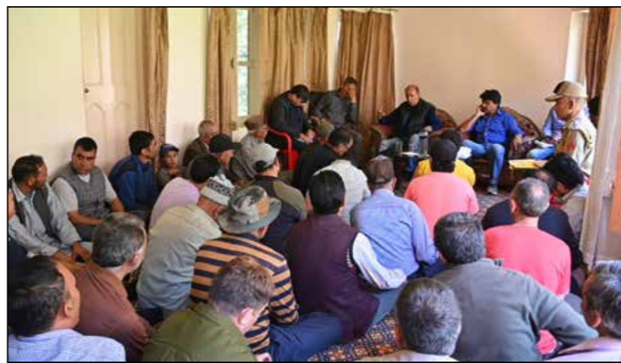
Chairman of the Reservation Commission for Actual Line of Control (ALC) Ladakh, Justice Bansilal Bhat interacting with the villagers of Line of Control (LoC).