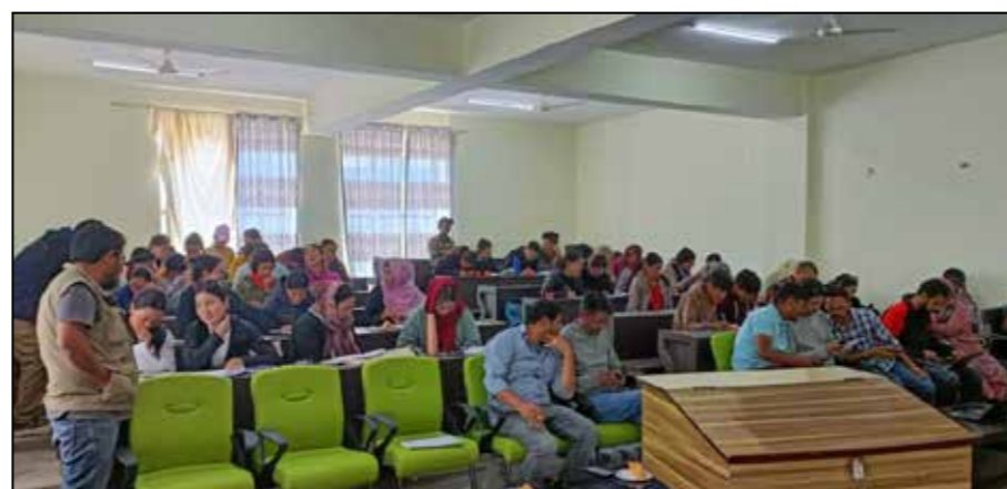
Caption: Participants during a day-long Environmental Education workshop titled "Exploring Biodiversity and Climate Change in Zanskar".