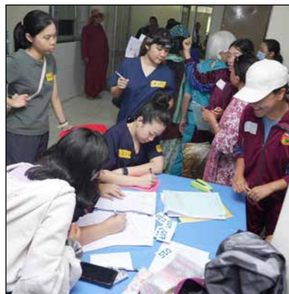
A charitable medical camp for screening of cervical cancer was organised by Ladakh Autonomous Hill Development Council (LAHDC) in collaboration with Himalayan Women's health project and Mahabodhi Hospital at Mahabodhi hospitals Saboo Dho. More than 300 female patients were screened.