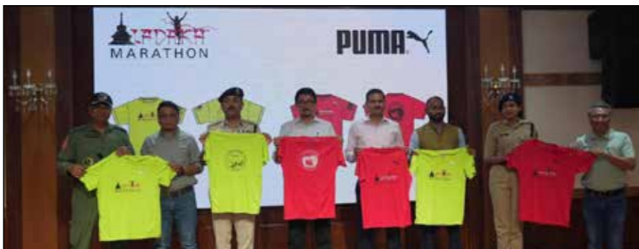
During the official launch of the official T-shirt of 11th Ladakh Marathon.

PUMA India, the official sportswear partner, will also provide performance gear