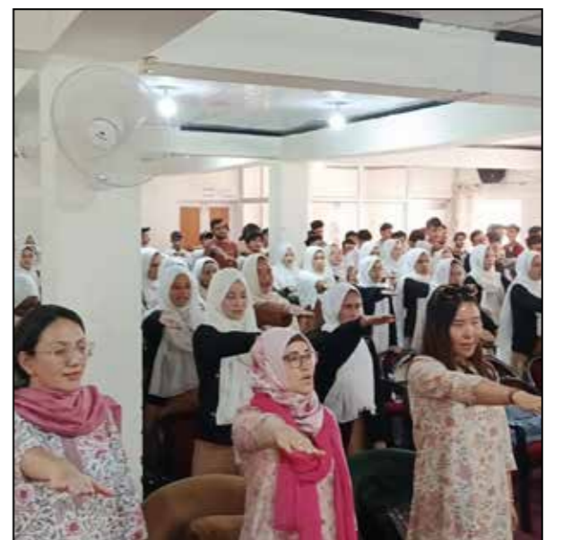
Culture and Seminar Committee, Government Degree College Kargil hold a pledge ceremony at Seminar Hall under Nasha Mukh Bharat Abhiyaan, a flagship campaign to enhance the evidence-based approach towards substance abuse.