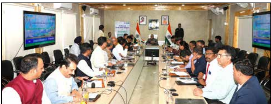
During the foundation laying ceremony of the Revamped Distribution Sector Scheme (RDSS) by POWERGRID in Union Territory of Ladakh.