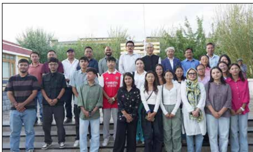
Qualified aspirants for the UPSC-CSE Coaching under the "REWAY OTZER 2024" program.