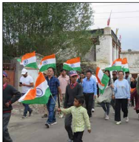
The Sub-Divisional Magistrate of Nyoma led a successful "Har Ghar Tiranga" rally at Nyoma. The rally commenced from the SDM office, with a large gathering of residents, HOD of various departments, government officials and school students, carrying the Indian National Flag.