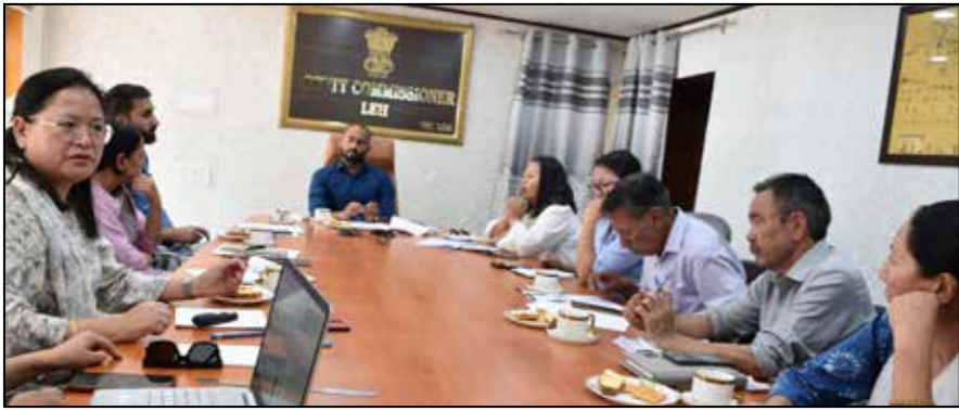
During the meeting on Stop Diarrhoea Campaign and National Deworming Day, initiatives by the Health Department, Leh.