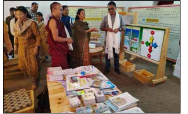
During the inauguration of the Bhoti Cell and a newly developed Language Lab at the District Institute of Education and Training (DIET) Leh.