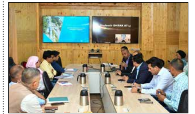
Meeting on the upgradation of the Emergency Operation Centre (EOC), Ladakh.