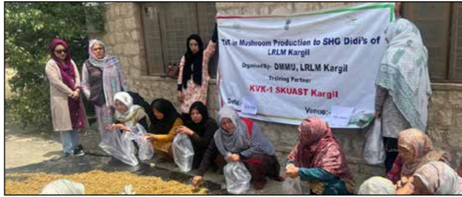
During the four-day Training of Trainers (ToT) program in mushroom production.