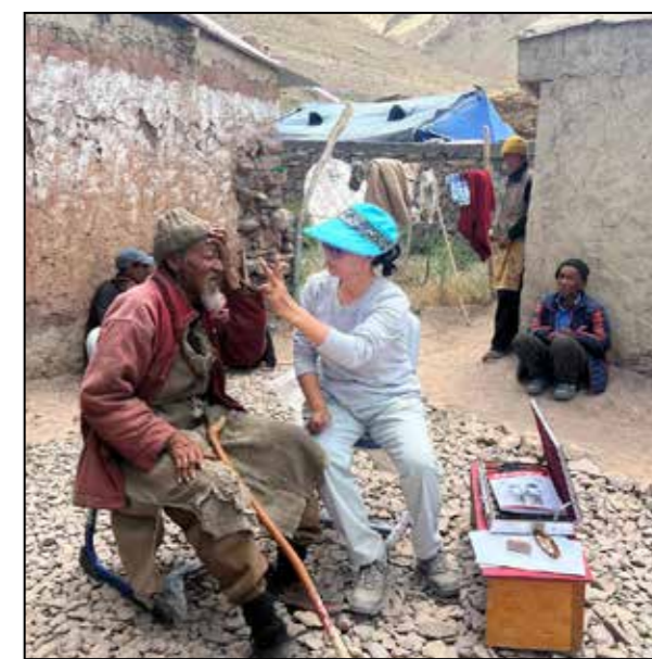
Community Health Center (CHC), Khaltse conducted a multi-specialty MMU (Mobile Medical Unit) camp in Photoksar, Nyerak, Yulchung, Skumpatta, Lingshed and Dipling villages of Singayalok block from July 18 to July 22.