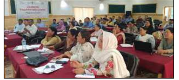
Participants during the 4-day CBSE training on Leading Transformation at DIET Leh.