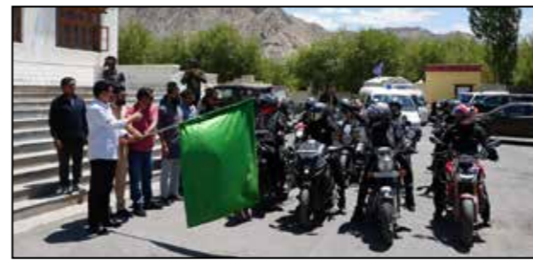
Flagging off a significant biking rally, "Ride with Pride," from the Council Secretariat.