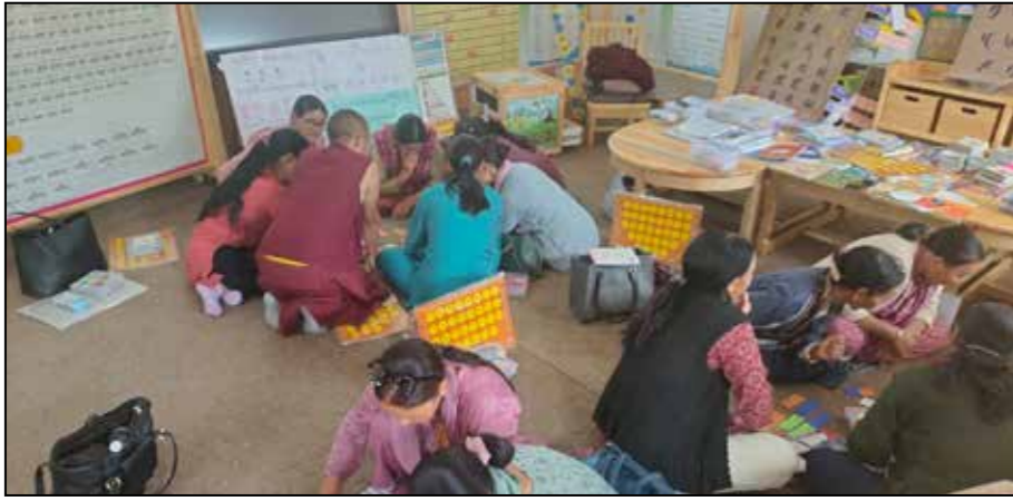
During the Bhoti Foundational literacy and numeracy (FLN) training program at DIET Leh.