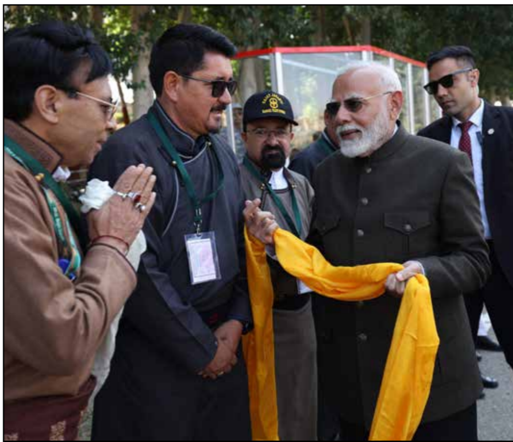
Prime Minister Narendra Modi welcomed by MP Ladakh, CEC Leh and Kargil.