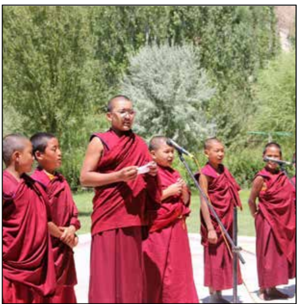
The fourth edition of a weeklong Ethical and Educational Exchange programme concluded on July 23 at the Shesrap Skyadtsal Ling, Library & Learning Centre, Thiksey Monastery, Leh. The programme was organised in collaboration with Thiksey Gonpa School, Shachukul Gonpa School and Disket Gonpa School.