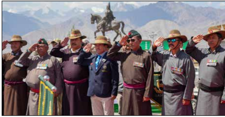
War veterans paying tribute to the martyrs on 25th Kargil Vijay Diwas.