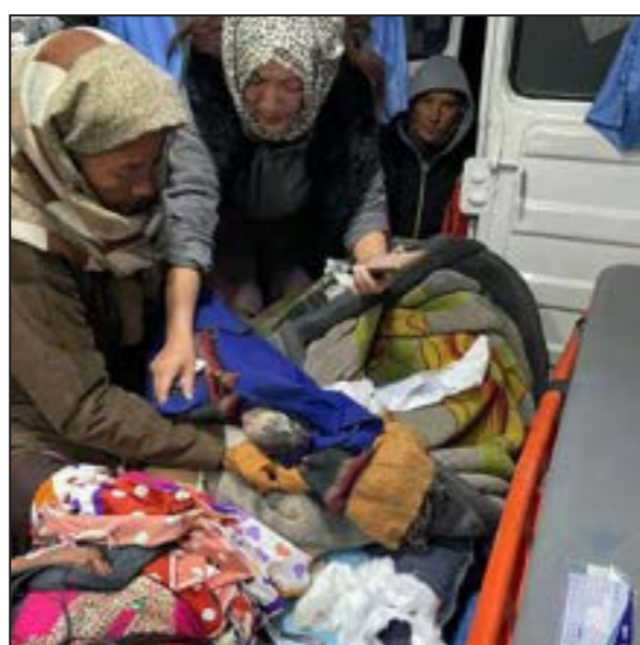
On June 10, the 108 Emergency Ambulance Service, under the National Health Mission (NHM) Ladakh, successfully facilitated a childbirth while en route to the Community Health Center (CHC) in Khatlse.