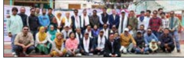
During the on-the-spot Music and Painting Competition at Govt. Modern Middle School Shakar Doo in Shakar-Chiktan Sub Division.

Reach Ladakh Correspondent KARGIL: Ladakh Academy of Art, Culture and Language (LAACL), Kargil, organized an on-the-spot Music and Painting Competition on June 12 at Govt. Modern Middle School Shakar Doo in Shakar-Chiktan Sub Division.