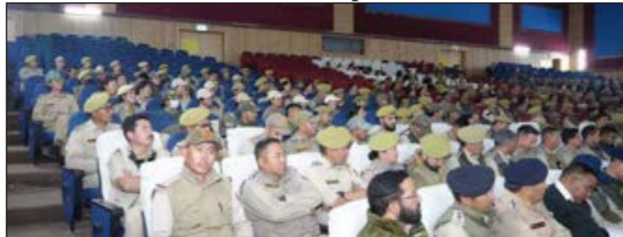
Officials during the seminar-cum-orientation program on the Three New Criminal Laws in Leh.