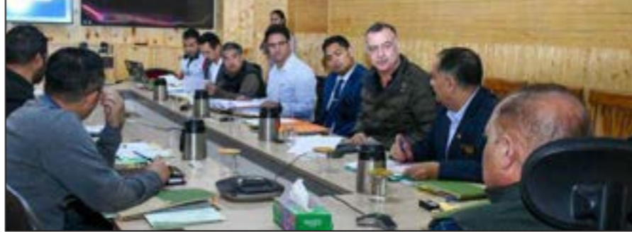
Focuses on forest conservation and human-wildlife conflict mitigation in Leh