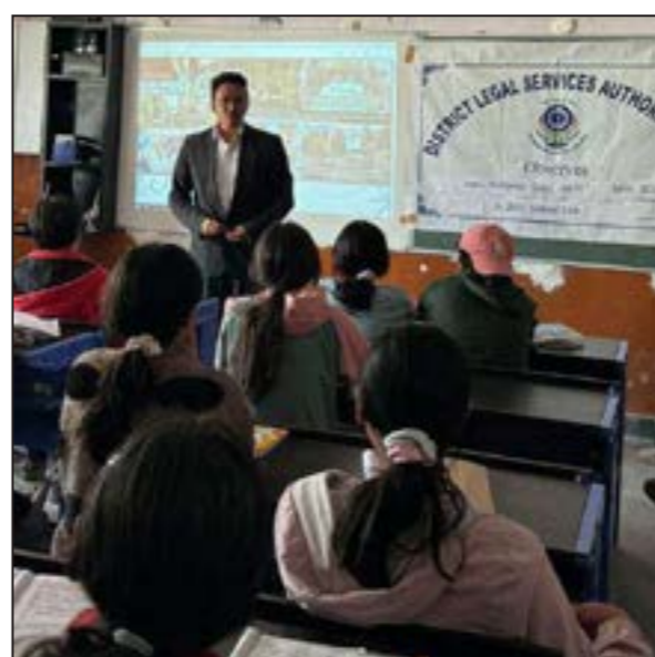
District Legal Services Authority (DLSA), Leh observed Anti-Tobacco Day at Jawahar Navodaya Vidyalaya (JNV), Leh