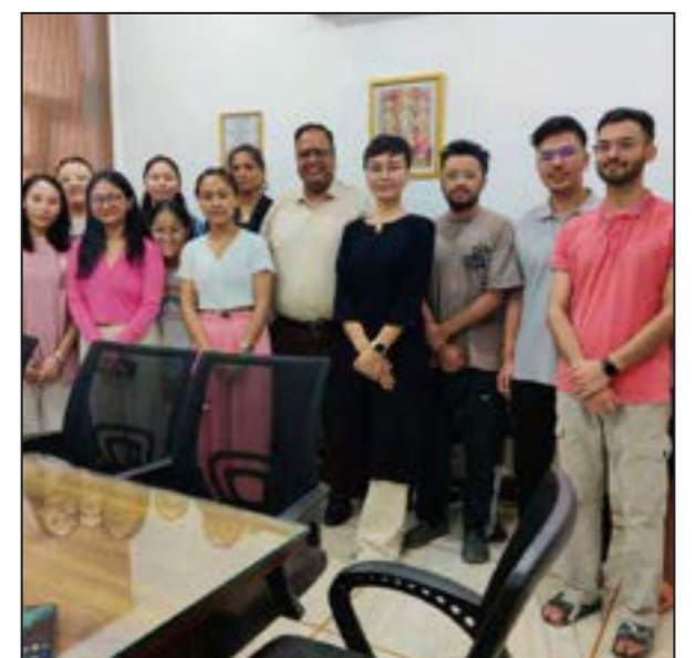
LAHDC Leh successfully concluded the Free Residential Coaching Program for the second batch under the "Rewe Odzer" program in collaboration with Sankalp IAS Academy in New Delhi.