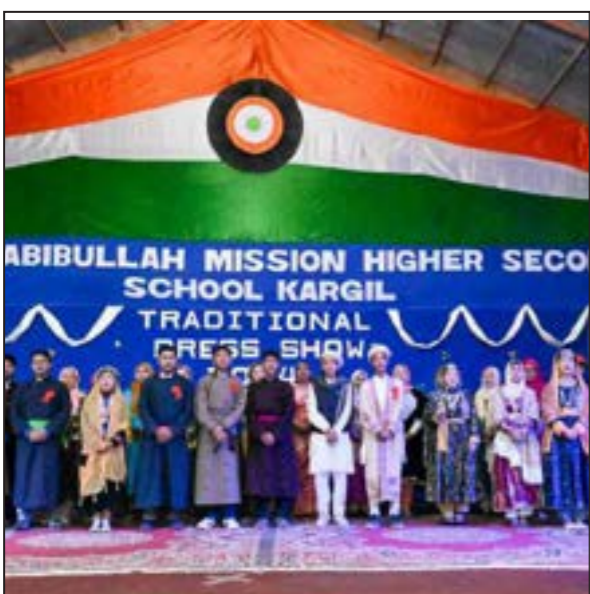
Munshi Habibullah Mission Higher Secondary School (MHMSS), Kargil, organized a traditional dress festival on June 1, highlighting the rich cultural heritage of the region.