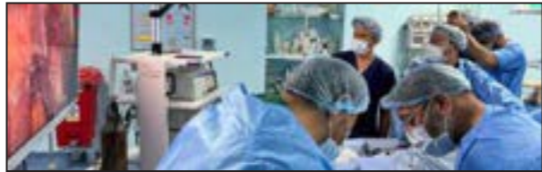
During the Minimally Invasive Surgery camp at District Hospital Kargil.

The camp utilized two advanced laparoscopic machines with 4K systems in the state-of-the-art Modu-