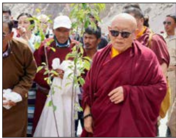
His Holiness Chetsang Rinpoche during the inauguration of 15th phase of the "Go Green Go Organic" mass plantation drive at Takmachik village.

Inaugurates 15th phase of "Go Green Go Organic"