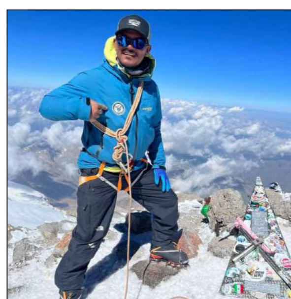
Mountaineer Skalzang Rigzin became the first Indian civilian to successfully scale the world's highest peak, Mount Everest (8,848m above mean sea level) without supplemental oxygen.