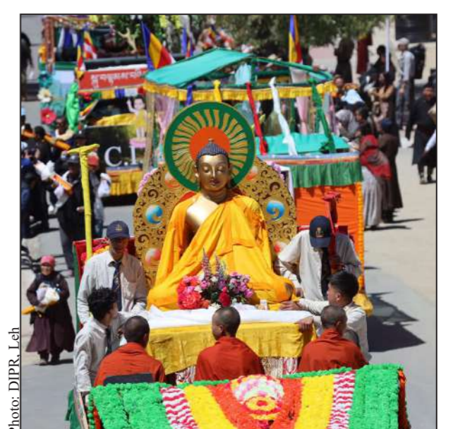
Leh celebrates Buddha Purnima on May 23rd. Celebrated on the 15th day of Saka Dawa (Vesak) of the Buddhist calendar, the festival marks the birth, enlightenment and Mahaparinirvana of Gautama Buddha.