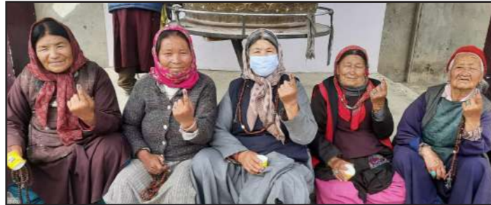
Elderly voters after polling in Ladakh on May 20.