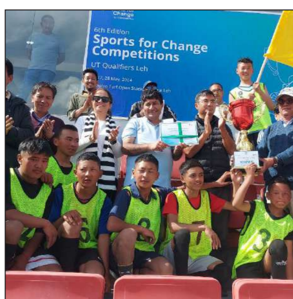
Changthang Zone with the winner's trophy after winning the final football match at Astro Turf Open Stadium, Spituk, on 29th May. The Sports for Change event was organized by Bal Raksha Bharat in collaboration with Directorate of Youth Services and Sports, Leh, and supported by HCL Foundation.