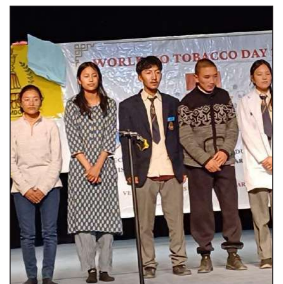
Students stage a drama at Lamdon Model Senior Secondary School, Leh to mark World No Tobacco Day on 31st May.