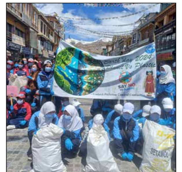
School students in Leh participating in a cleanliness drive on World Earth Day organised by the Ladakh Pollution Control Committee.