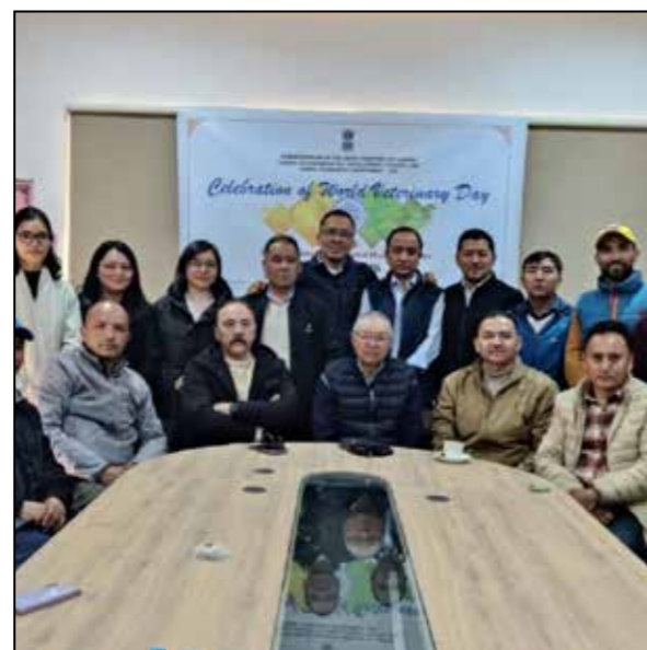
Animal Husbandry Department, Leh, observing World Veterinary Day.