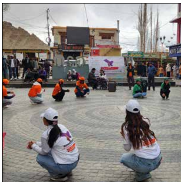
Ladakh University students performing a street play as part of SVEEP campaign in Leh market.