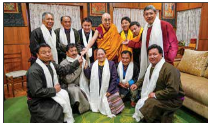
Delegation of Hill Council Leh during a meeting with His Holiness the 14th Dalai Lama in Dharamsala.