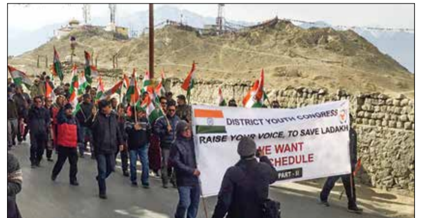
Protest rally demanding sixth schedule of Ladakh by District Youth Congress.