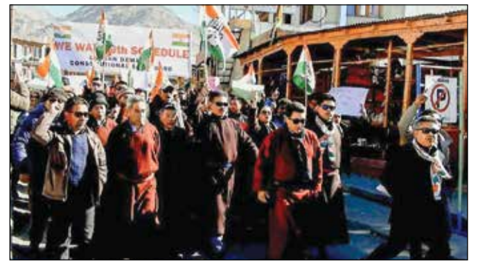
District Congress Committee, Leh party leaders during the protest rally demanding sixth schedule for Ladakh.

from the Congress party to the BJP leaders who hold a bigger responsibility in raising the voice of the people. "If we fight in the name of party and power of the seats now, the whole region and the future generation will suffer. It is high time we have to stand united for the greater cause of Ladakh", he added.