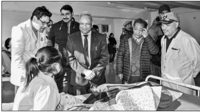
RK Mathur, LG Ladakh interacting with the patient during his visit to SNM Hospital, Leh.