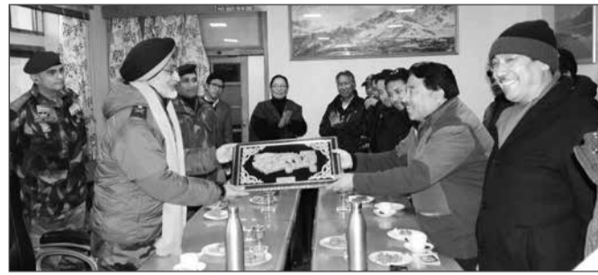
GoC 14 Corps Leh, Lt. General Harinder Singh during a meeting with Hill Council, Leh.

Resolves to further strengthen army and civil relation