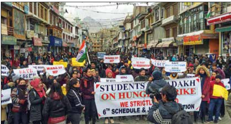
Protest rally demanding sixth schedule for Ladakh by student organisation in Leh.

Seeks answer from MP, Ladakh, for being silent in Parliament