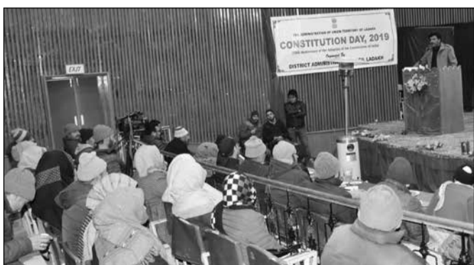
Feroz Ahmad Khan, CEC, LAHDC, Kargil addressing the elected representatives of Kargil during the campaign on Constitution of India.