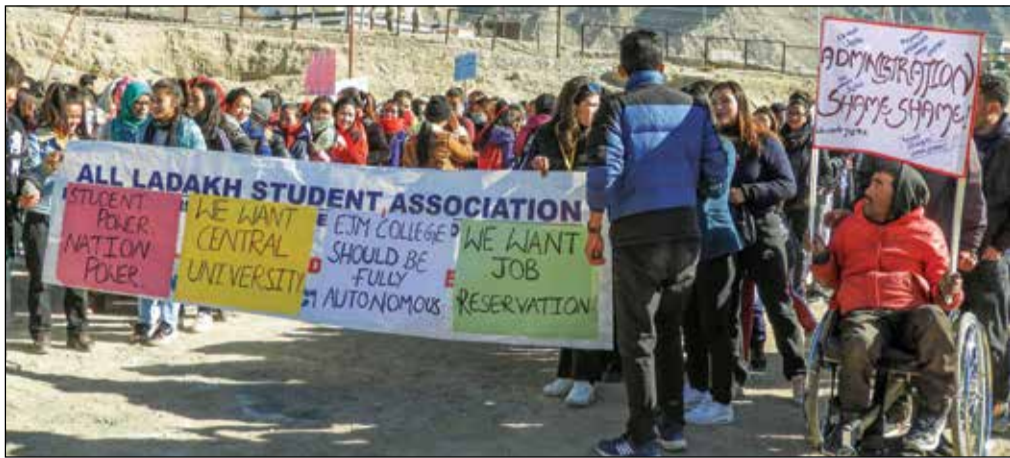
Students of Ladakh protesting and demanding their education rights.

Alleges public representatives and politicians for paying least attention towards students' issues