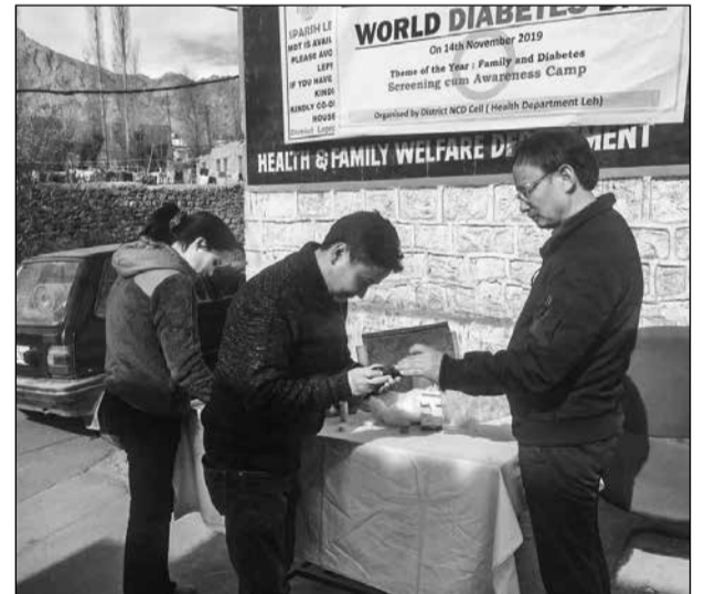
World Diabetes Day observed at CMO Office complex organized by District NCD Cell (Health Department Leh). The theme for this year was 'Family and Diabetes'. Diabetes is a leading cause of blindness, amputation, heart disease, kidney failure and early death. Simple action can reduce the risk.