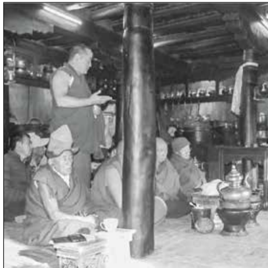
Monks of Rezhong monastery during the inauguration of Heritage kitchen.