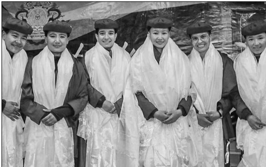
Hemis and Chemray monastery and Young Drukpa Association (YDA) hosted a dinner reception in honour of Kung Fu Nuns who received the Asia Society's Game Changer Awards in recognition of their outstanding work in tackling the Key Challenges of the Himalayas in the 21st Century, gender equality and environment issues.