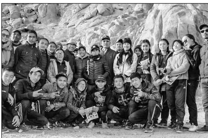
20 students from Jamyang School, Leh participated in the adventure course at Ladakh Mountaineering & Adventure Club's Veer Savarkar Institute of Mountaineering and Search & Rescue site, Shey from October 27 till 31.