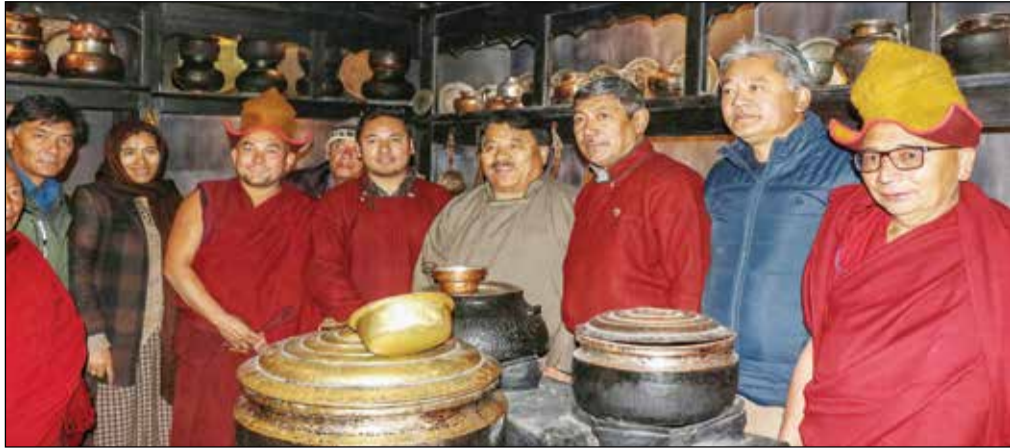
The newly renovated Heritage kitchen at Rizong Gonpa