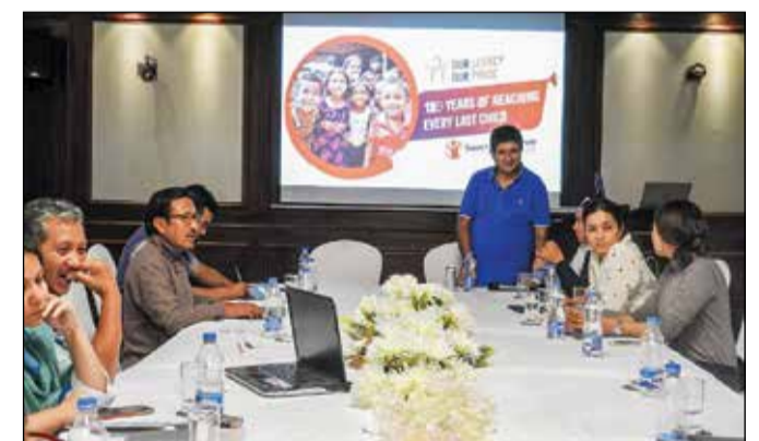
Stakeholders of child protection and media personnel's during the meeting at Indus Valley Hotel, Leh

Various children related issues such as corporal punishment, child abuse, substance abuse, child labour, disability, bullying, discrimination, STDs and HIV/