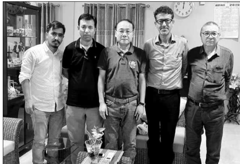
The Assam delegation with Justice T. Vaiphei, Chairperson Assam Human Rights Commission and Former Chief Justice High Court of Tripura at Guwahati.