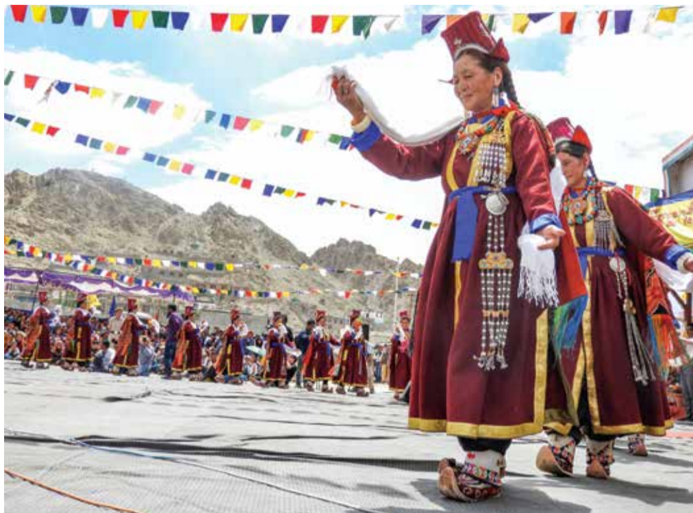
Artist of Nubra valley dressed in traditional attire performing folk dance during the inaugural day of Ladakh Festival