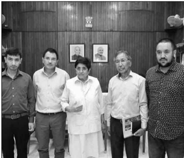
The Puducherry delegation with D.r Kiran Bedi, Lieutenant Governor of Puducherry at Raj Niwas.