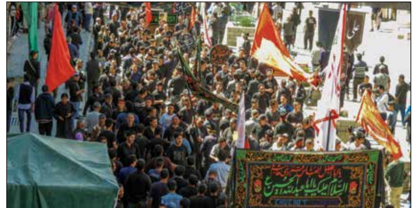
Shia Muslim beating their chest and reciting lamentation during the mourning procession.

Over 600 youths register their names for blood donation