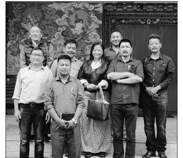
The Sikkim delegation with her excellency Princess of Sikkim