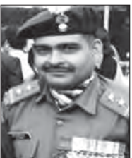
Grenadier Yogender Singh Yadav, 18 Grenadiers, Param Vir Chakra

On 20 Jun 1999, Captain Vikram Batra, Commander, Delta Company, was tasked to attack Point 5140 during Operation VIJAY. Leading his men from the front, the officer in daredevil assault pounced on the enemy and killed four intruders in a hand to hand fight. On 07 Jul 1999, in yet another operation in the area of Point 4875, Captain Batra sustained grievous injuries. Leading from the front he rallied his men and pressed on the attack and achieved a near impossible military task. The officer, however, succumbed to his injuries. Inspired by this display of extraordinary junior leadership, the troops fell upon the enemy with vengeance and annihilated them, finally capturing Point 4875. For this valiant action, he was awarded Param Vir Chakra (POSTHUMOUS).