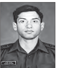
Lieutenant Manoj Kumar Pandey, 1/11 Gorkha Rifles, Param Vir Chakra (POSTHUMOUS)

Lieutenant Manoj Kumar Pandey of 1/11 Gorkha Rifles took part in a series of boldly led attacks during Operation Vijay. On the night of 2/3 July 1999, as the enemy fired from the surrounding heights, the officer was tasked to clear the interfering enemy positions, so as to prevent his battalion from getting day lighted. The officer quickly moved his platoon to an advantageous position under intense enemy fire. He was injured on the shoulder and legs by enemy fire while clearing the position. Without caring for his grievous injury, he led the assault on the fourth position urging his men and destroyed the same with a grenade, even as he got a fatal MMG burst on his forehead. He thus showed most conspicuous bravery, indomitable courage, devotion to duty of an exceptionally high order, in the face of the enemy and made the supreme sacrifice in the highest traditions on the Army. He was awarded the Param Vir Chakra (POSTHUMOUS) for his gallant action during this battle.