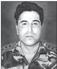
Captain Vikram Batra, 13 Jammu & Kashmir Rifles, Param Vir Chakra (POSTHUMOUS)

Rifleman Sanjay Kumar volunteered to be the leading scout of the attacking column tasked to capture Area Flat Top of Point 4875 in the Mushkoh Valley on 04 July 1999. He displayed indomitable spirit and courage when he charged the enemy bunker with utter disregard to personal safety. In the ensuing hand to hand combat, he killed three of the intruders and was himself seriously injured. Despite being injured, he charged on to the second bunker. Rifleman Sanjay Kumar displayed extraordinary courage and devotion to duty of an exceptionally high order in the face of the enemy. For this valiant action, he was awarded Param Vir Chakra.