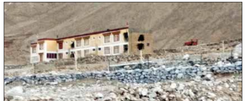
A demolished building at Spangmik