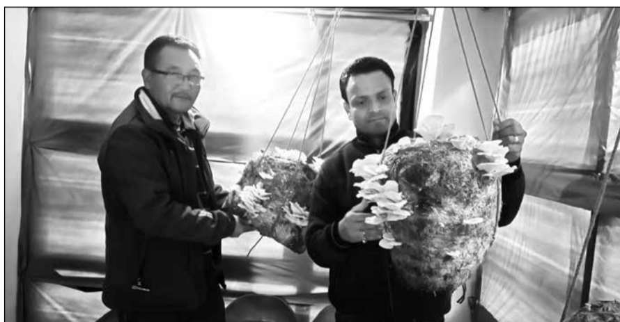
Mushroom cultivation under glasshouse at KVK-Leh, SKUAST-K in the month of December

Because of its high protein, high fibre, high K:N ratio, low calories and fat (rich in linoleic acid and devoid of cholesterol) diabeticians include mushrooms in diets for people suffering with or prone to obesity, hypertension, etc. Mushrooms are also found to be a wonderful source of nutraceuticals, antioxidants, anticancer, anti-inflammatory, cardiovascular, anti-microbial, anti-diabetic,