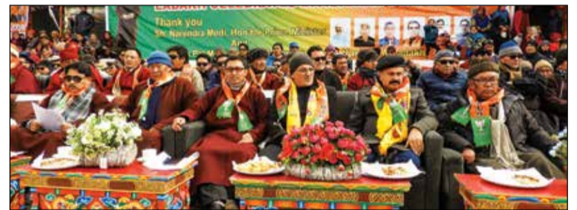
BJP party leaders during the grand celebration for Divisional status for Ladakh at Pologround, Leh.

Kargil protests over the decision of divisional headquarters in Leh