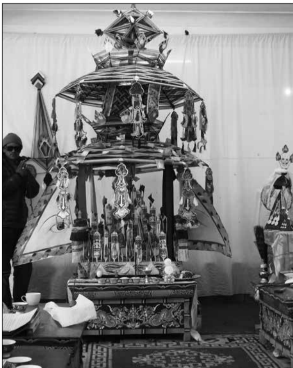
'Storma' ritual effigy was prepared by the monks of Korzok monastery while 'Dhos' thread crosses to trap evil spirits was prepared by the monks of Takthog monastery.