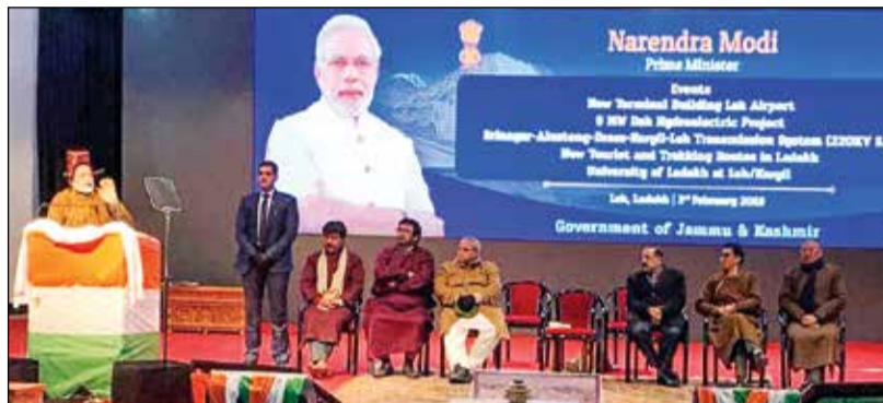
Prime Minister while addressing about the development projects.

He said that the mega projects which are