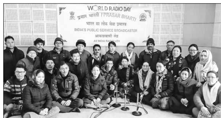
World radio day was celebrated on the theme 'Dialogue, Tolerance, and Peace' on February 13.