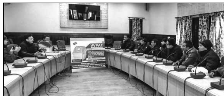
Training cum demonstration held on the use of Electronic Voting Machine (EVM) and Voter Verifiable Paper Audit Trail (VVPAT) in Leh.