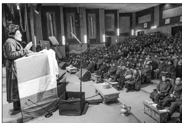
PM Modi addressing the audience during his visit to Leh