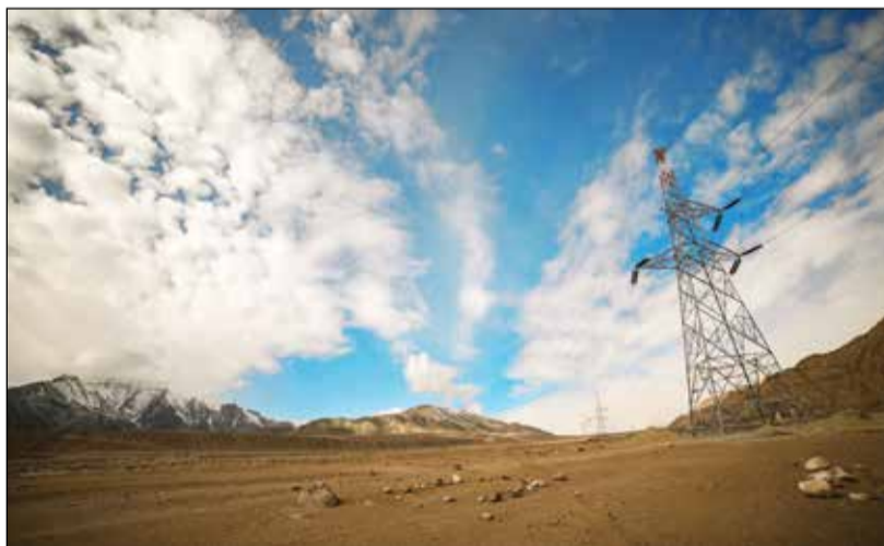
Ladakh connected to Northern Grid.

To ensure round-the-clock power supply in all-weather conditions in Ladakh