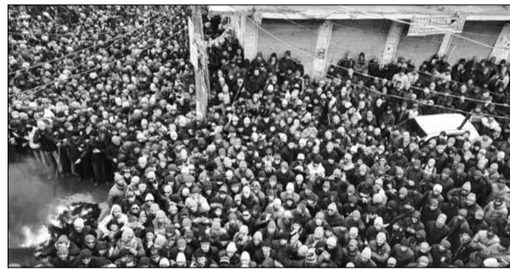
Kargil protests against the setting up of Divisional headquarters in Leh.