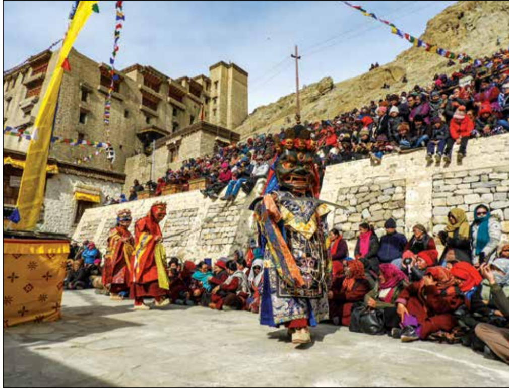
Monks of Lamayuru monastery performing mask dance in Leh.