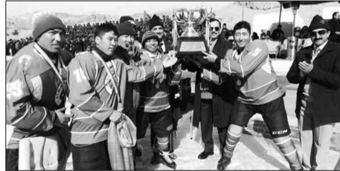
1 Ladakh Scouts lifting the Inter-Battalion Ice Hockey Championship trophy

Team of best players from the regiment selected to participate in the forthcoming National Ice Hockey Championship