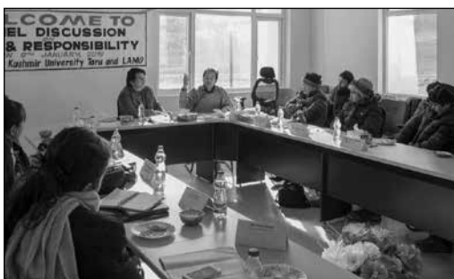
Panel discussion on Media and its responsibility at Kashmir University satellite campus, Leh.