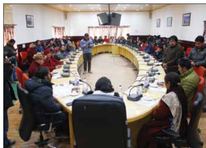
Participants of the Birding Guide Training Program during the inaugural day.