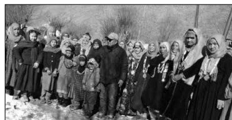
Anganwadi workers of Tai Suru in traditional attire during the cultural demonstration programme and awareness regarding various loan schemes of Social Welfare Department and Women Development Corporation.