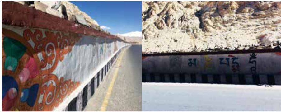
Before and after picture of Mani wall on the junction of Sabo and Choglamsar. Blackening of Mani wall indicates threat of air pollution in Leh