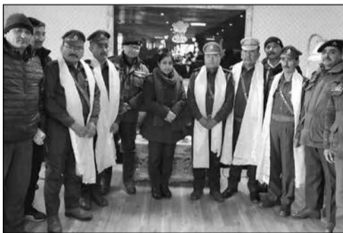
Pipping ceremony of the newly promoted officers of the District Police, Leh on January 11.