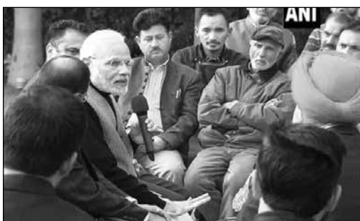
Prime Minister met newly elected Sarpanch of J&K in New Delhi on December 20.