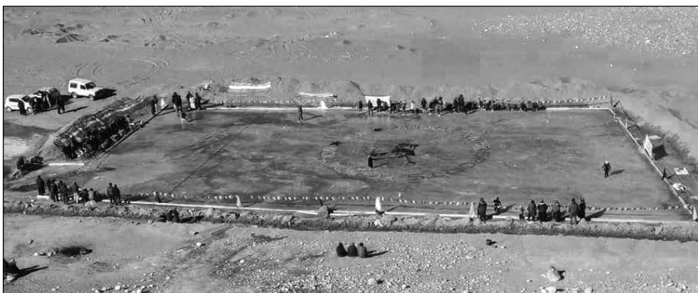
Zanskar has its first ever Ice Hockey Rink along with Ice Hockey Training program at Muski Chumik.