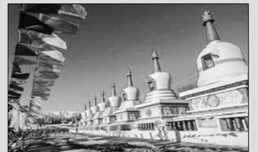
Chorten Gyath (Eight Stupas) at Jevetsal, Shey.