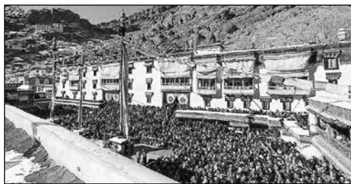
The 5th Winter Hemis Festival concluded on December 20 at Hemis Monastery. More than 10,000 devotees gathered at the courtyard to participate and complete thousands of Ganachakra and 300 million chanting of Avalokiteshvara Mantra.