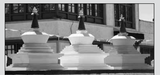
Rigsum Gonpo at the entrance of Thiksey Monastery, it always comes in tri colors.