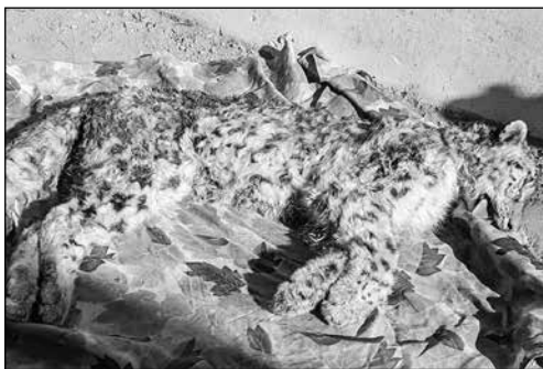
Stray dogs menace might have led to the death of a Snow Leopard (an indigenous endangered animal) at Kharu.