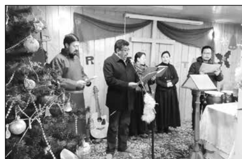
Christmas celebrated with great enthusiasm and joy in Leh.