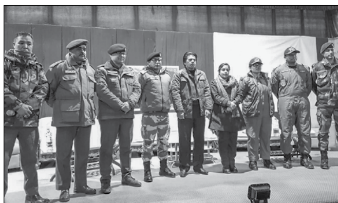
Experts from the various forces during the one-day career guidance organised by District Police, Leh.