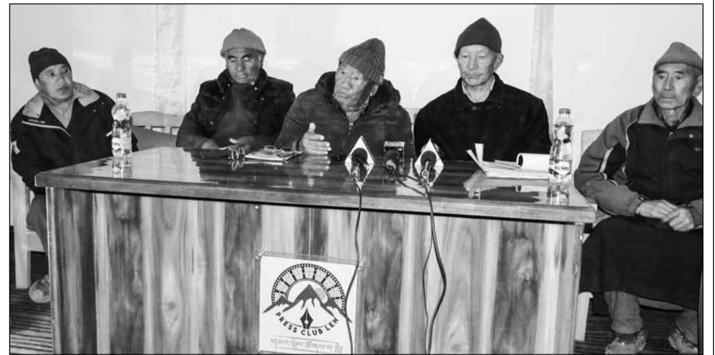
Members of Himalayan Buddhist Cultural Association during the press conference.