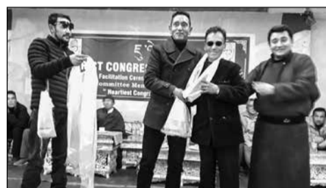
District Congress Committee, Leh felicitates newly elected Sarpanches, Panches and Municipal Committee members on November 28 at Shenam Community hall.