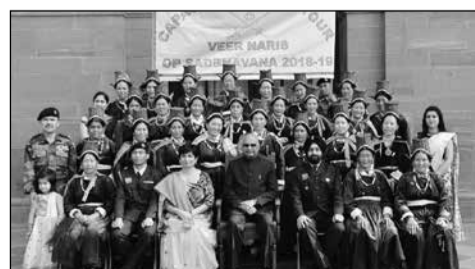
A meeting with President Ram Nath Kovind and Veer Naaris (widows of war veterans) from Ladakh at Rashtrapati Bhavan, New Delhi during the Capacity Building tour under Operation Sadbhavana.