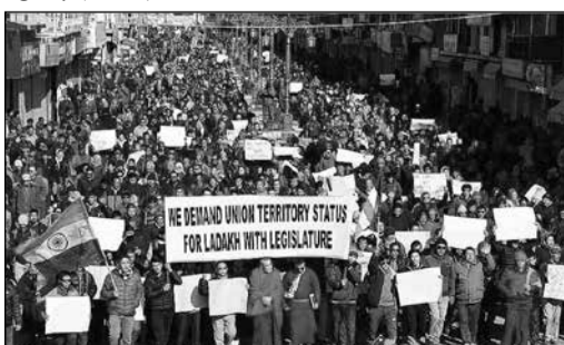
Leh uproar UT with legislature demand for Ladakh on November 26.