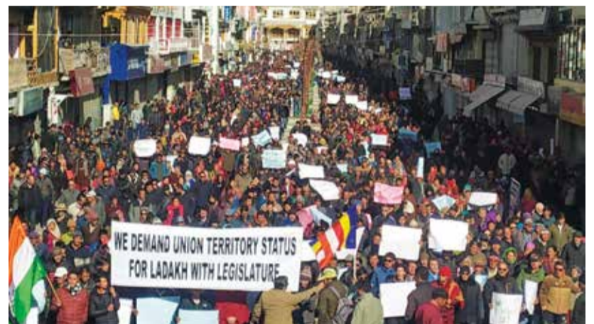
People during the peaceful protest demand of UT for Ladakh.