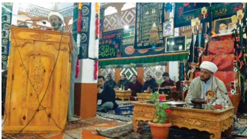
During the celebration of Eid-ul Milad-Un-Nabi, Birth Anniversary of Prophet Mohammad.